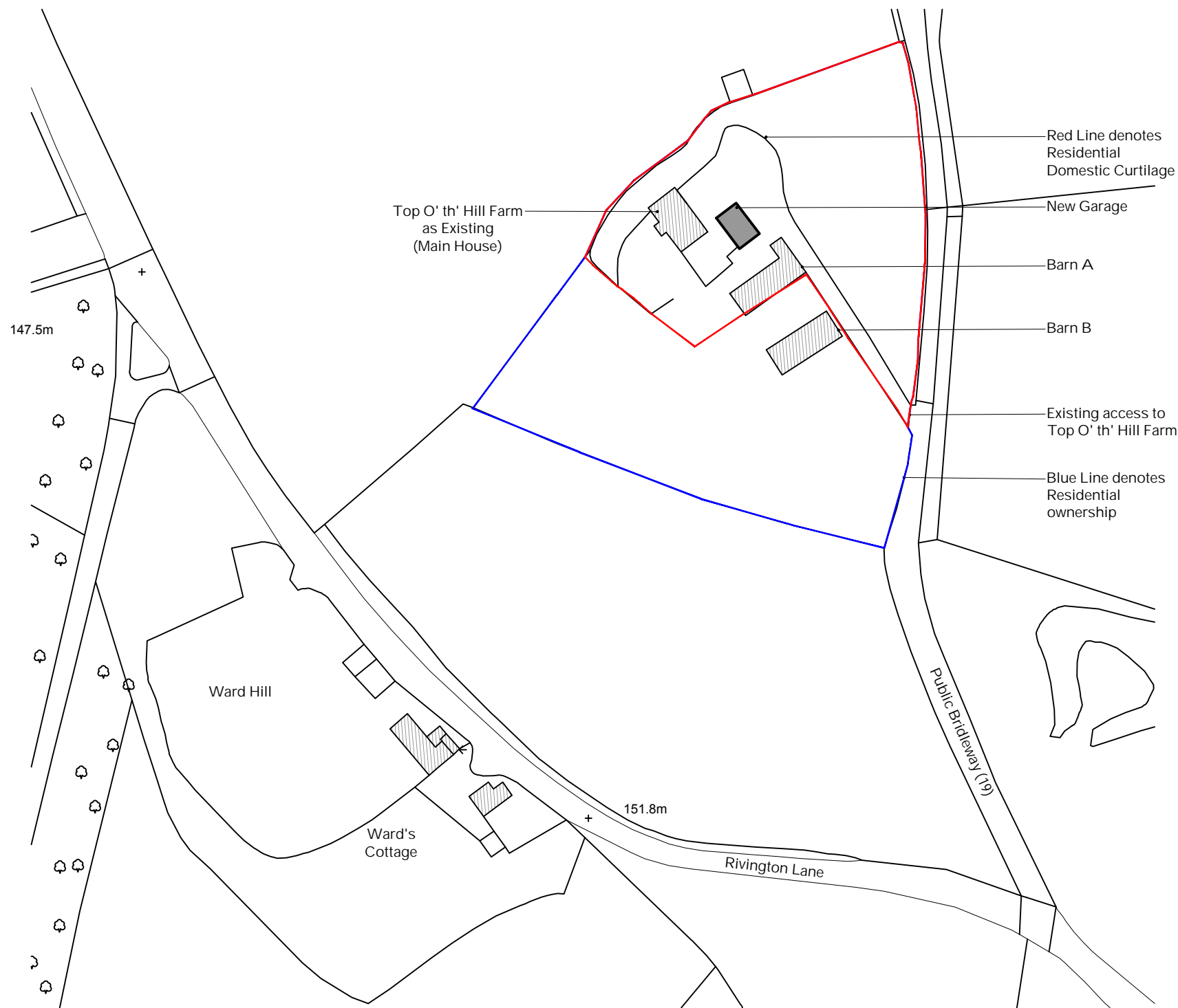
Proposed Location Plan Scale - 1:1250 at A3