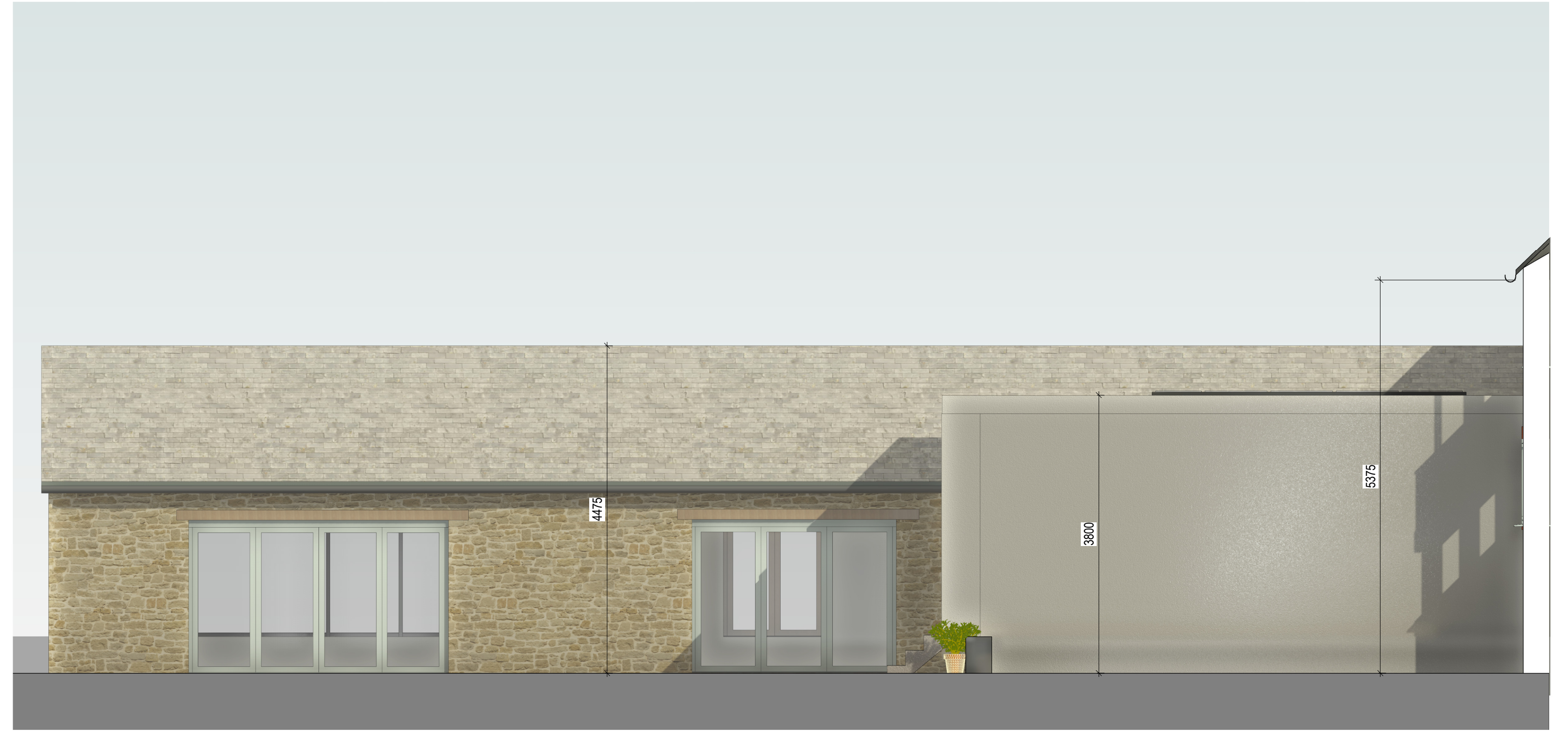
2 Side Elevation as Proposed CW 08 70 02 1:50