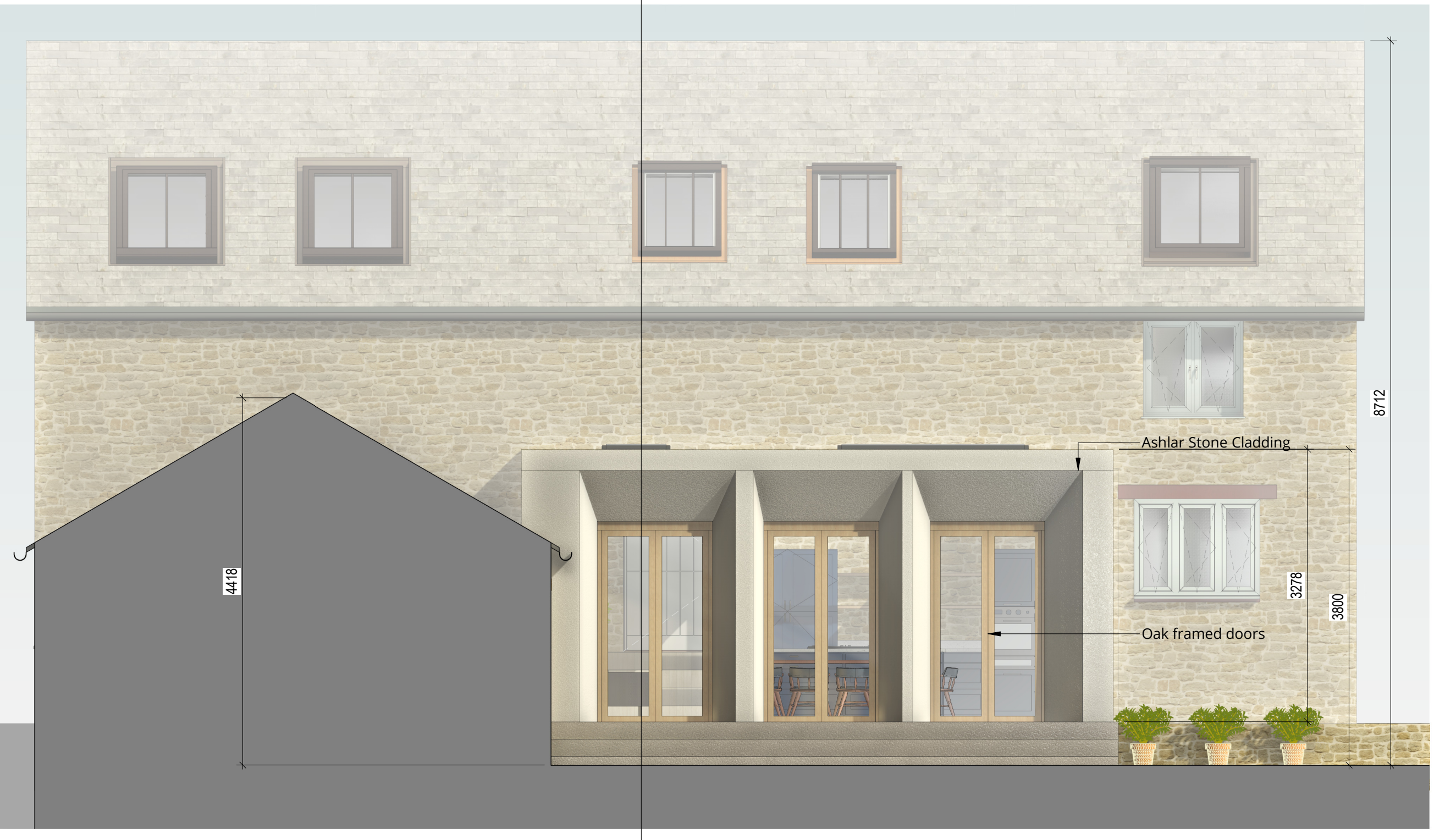
1 Rear Elevation as Proposed CW 08 70 02 1:50