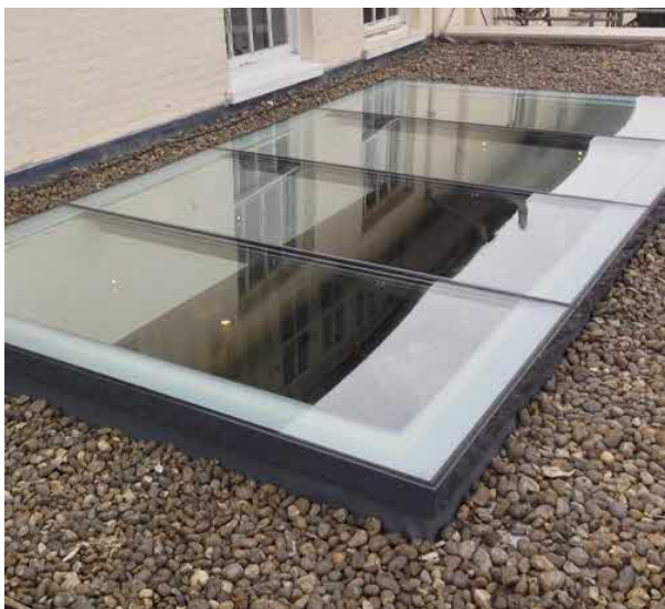
Glazed Aluminium rooflights above.