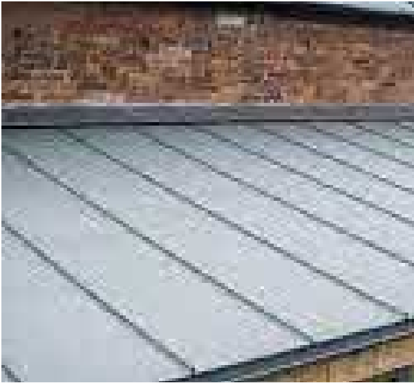
Standing seam roof proposed to flat roof