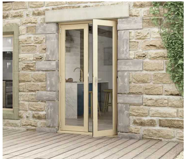
Oak doors proposed externally.