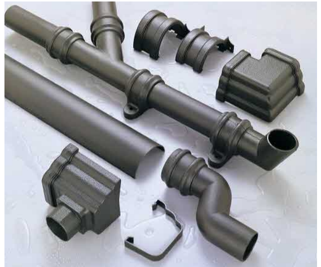
Cast iron effect heritage downpipes and gutters in black, with rise and fall gutter brackets.