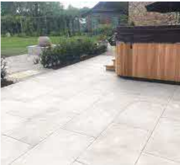
Sandstone patio to rear garden - extents tbc.