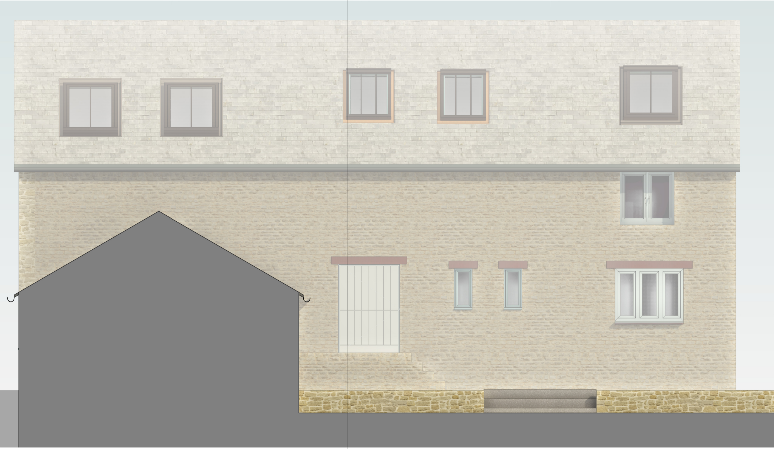
1 Rear Elevation CW 08 70 01 1:50