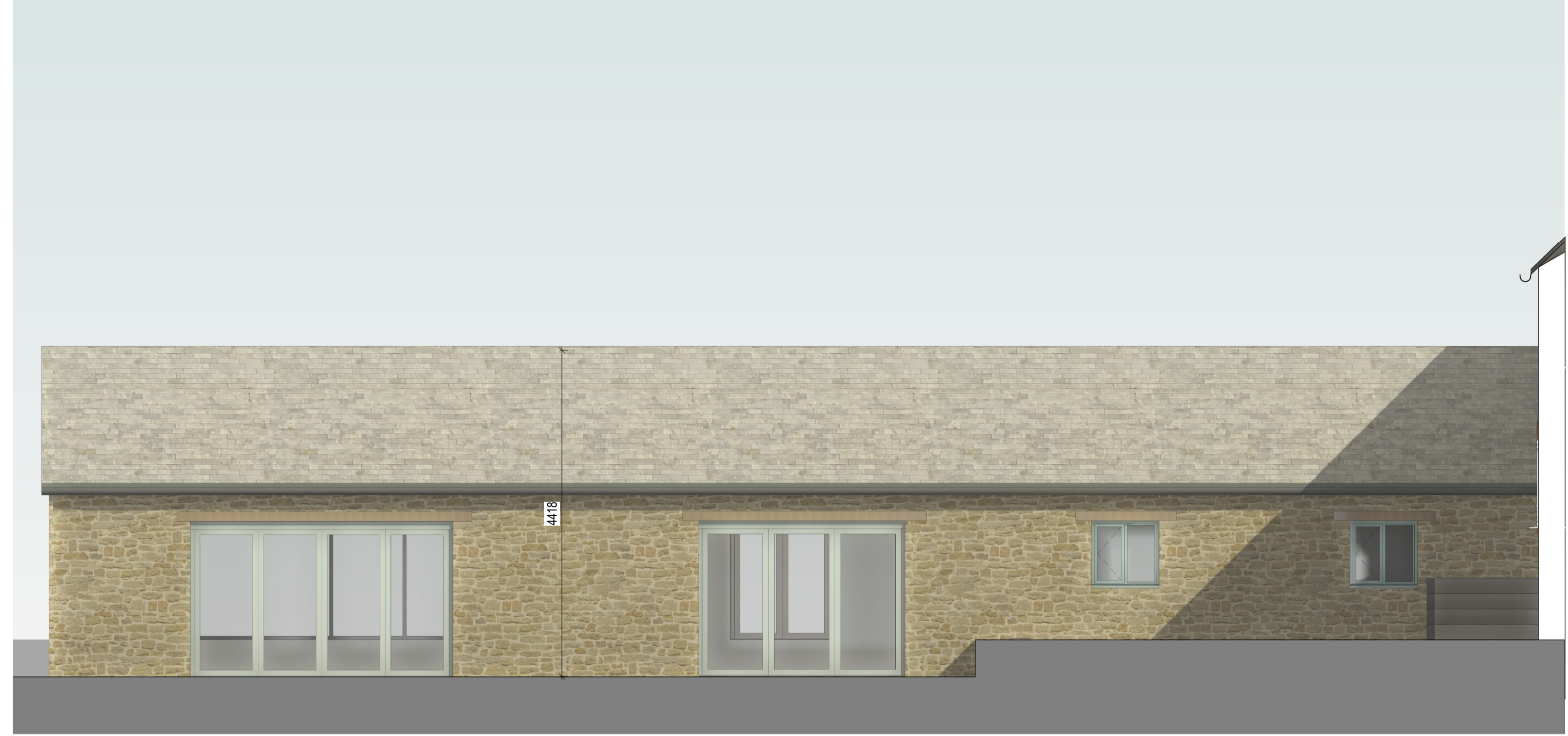
2 Side Elevation CW 08 70 01 1:50