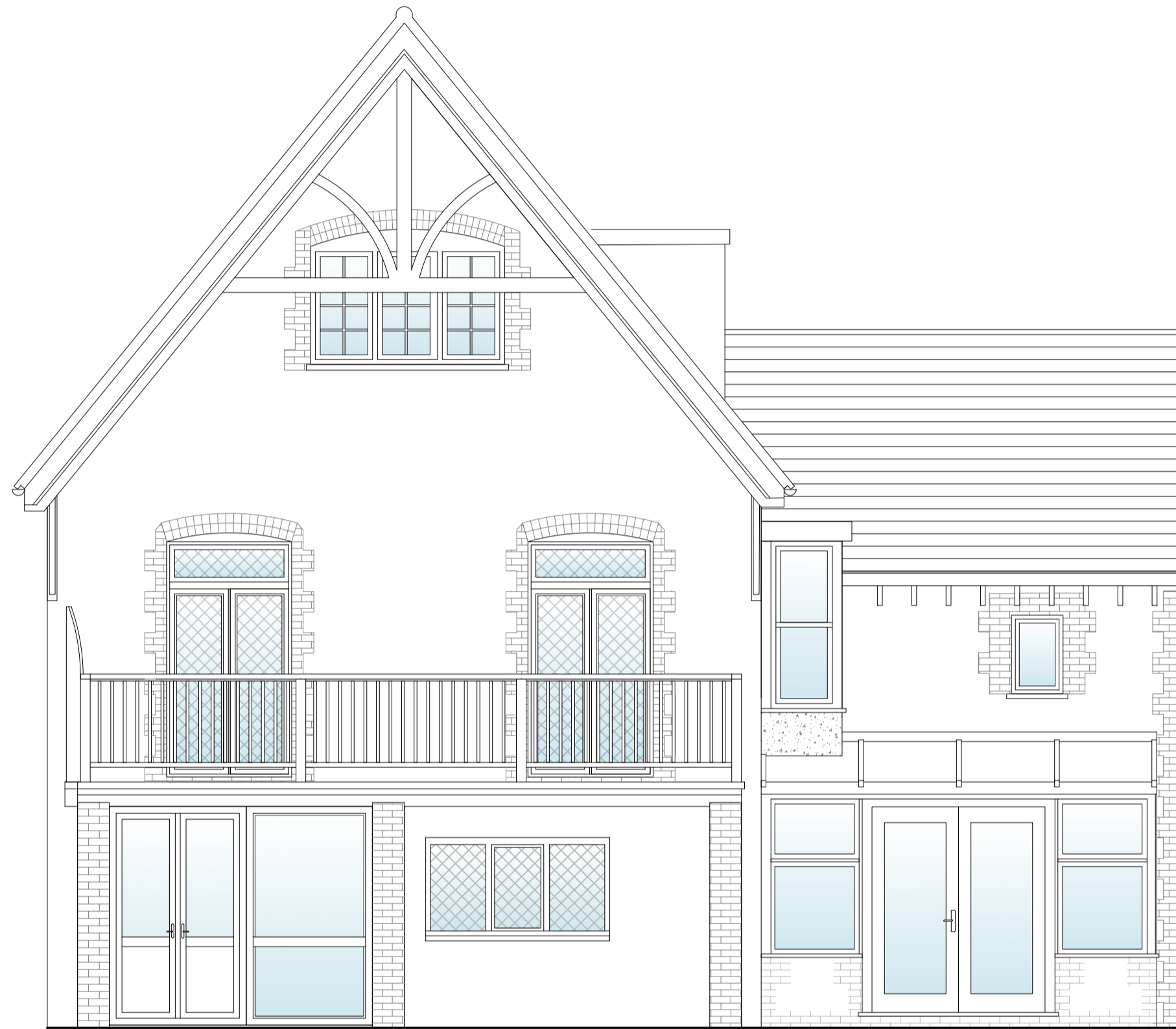
AS EXISTING FRONT ELEVATION (NW) 1:50 @ A1