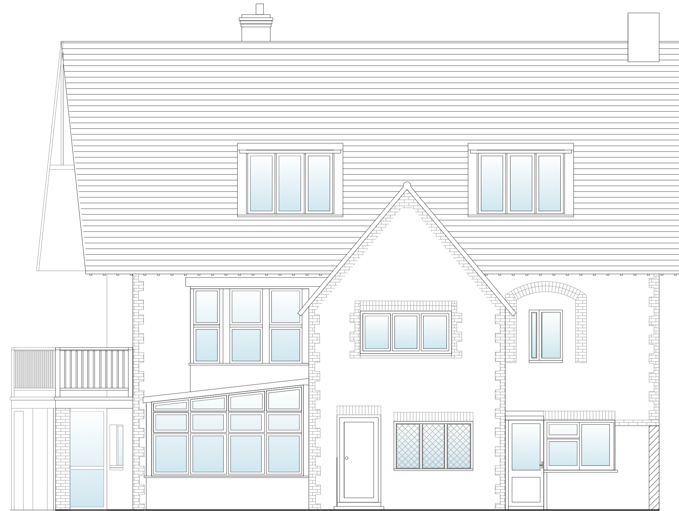
AS EXISTING SIDE ELEVATION (SW) 1:50 @ A1