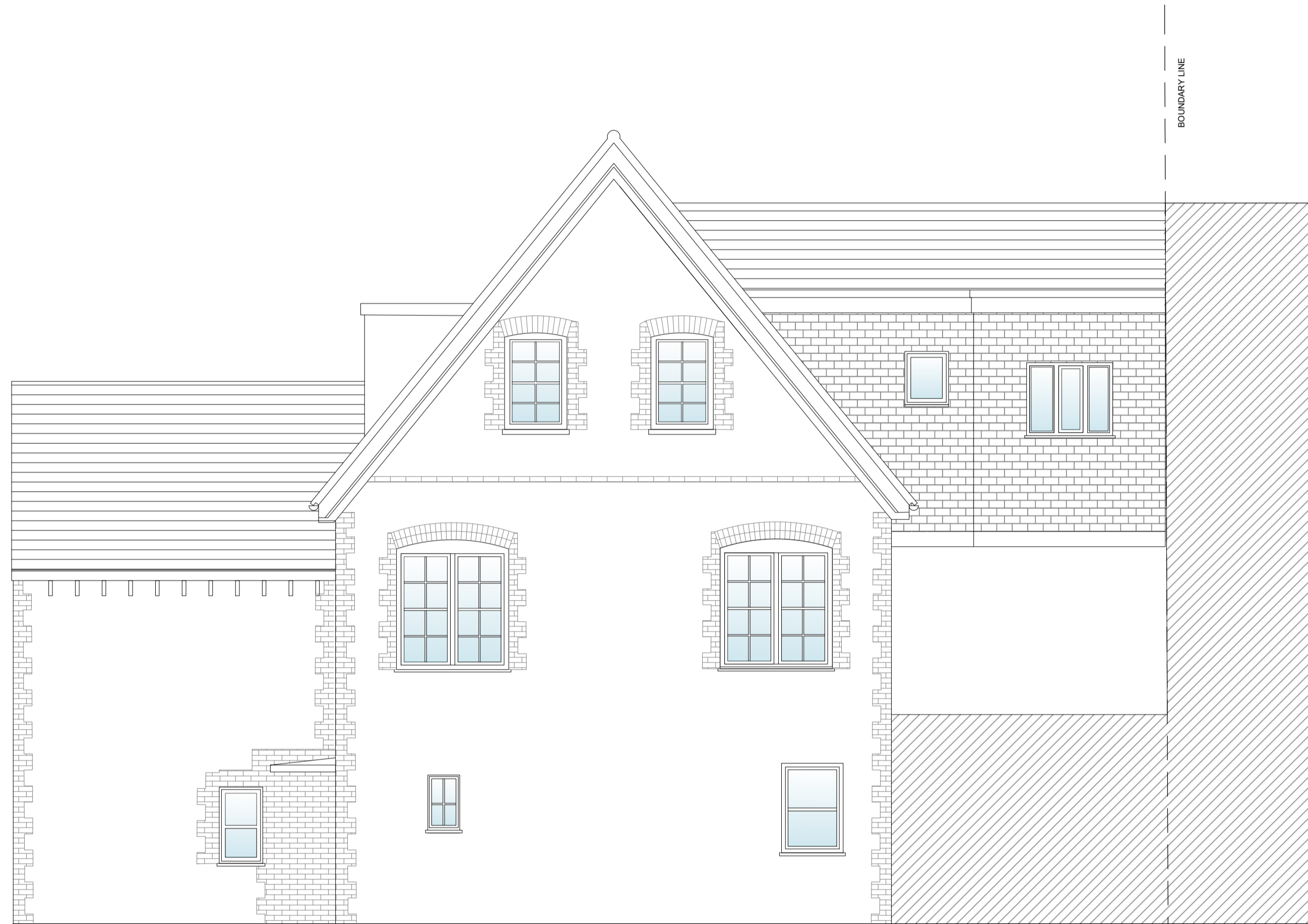
AS EXISTING REAR ELEVATION (SE) 1:50 @ A1