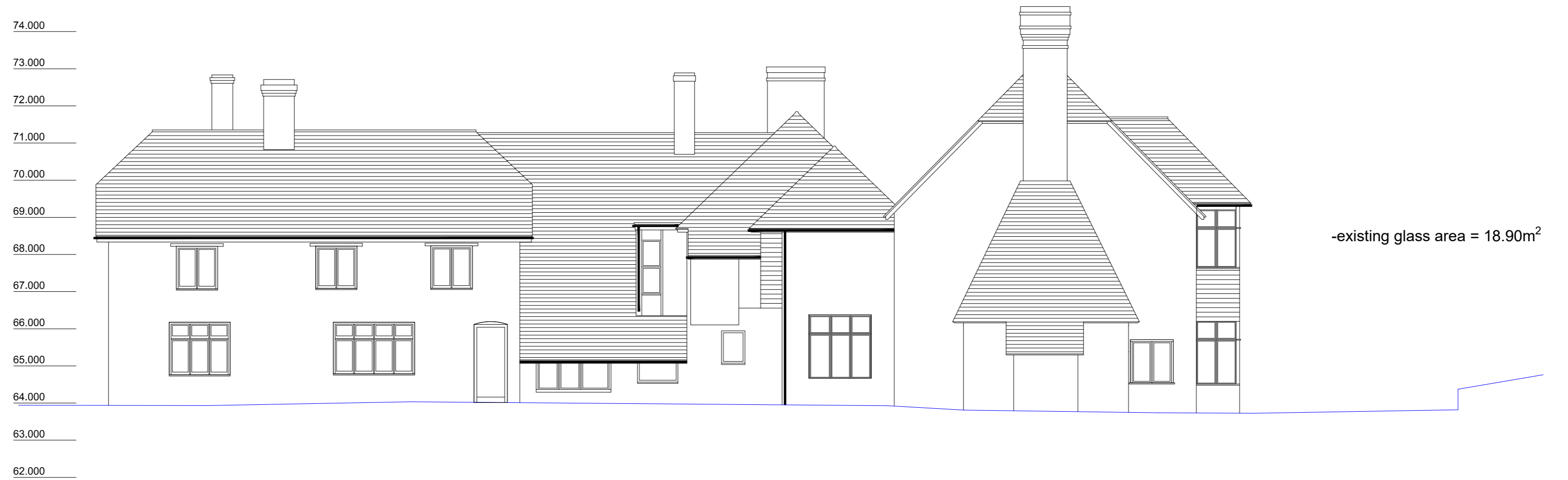
elevation D - West