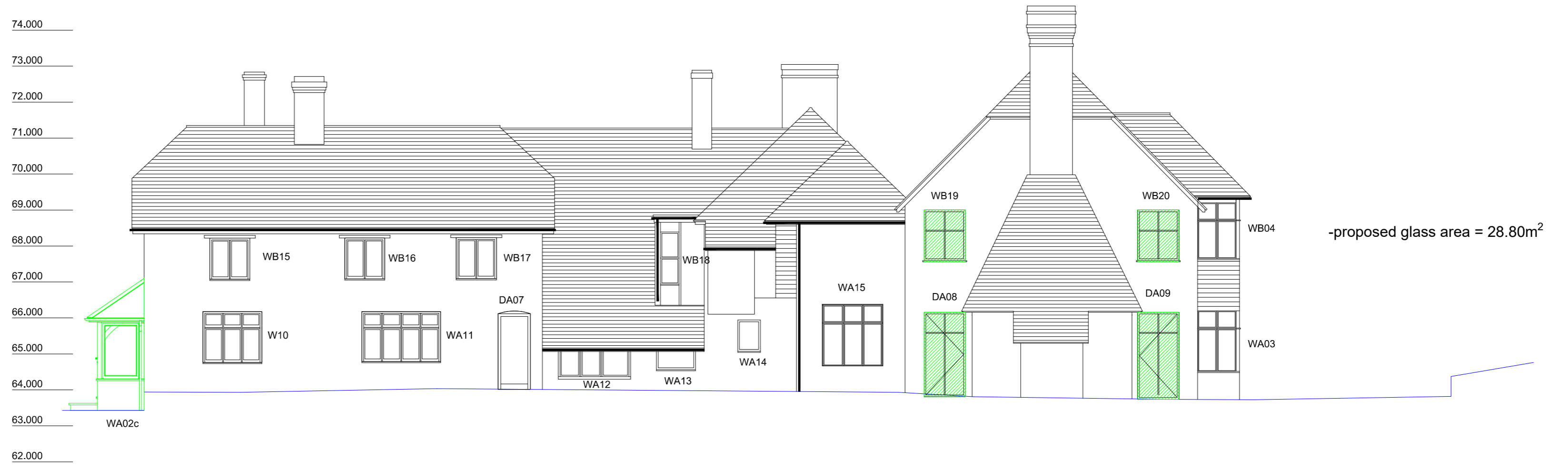
elevation D - West