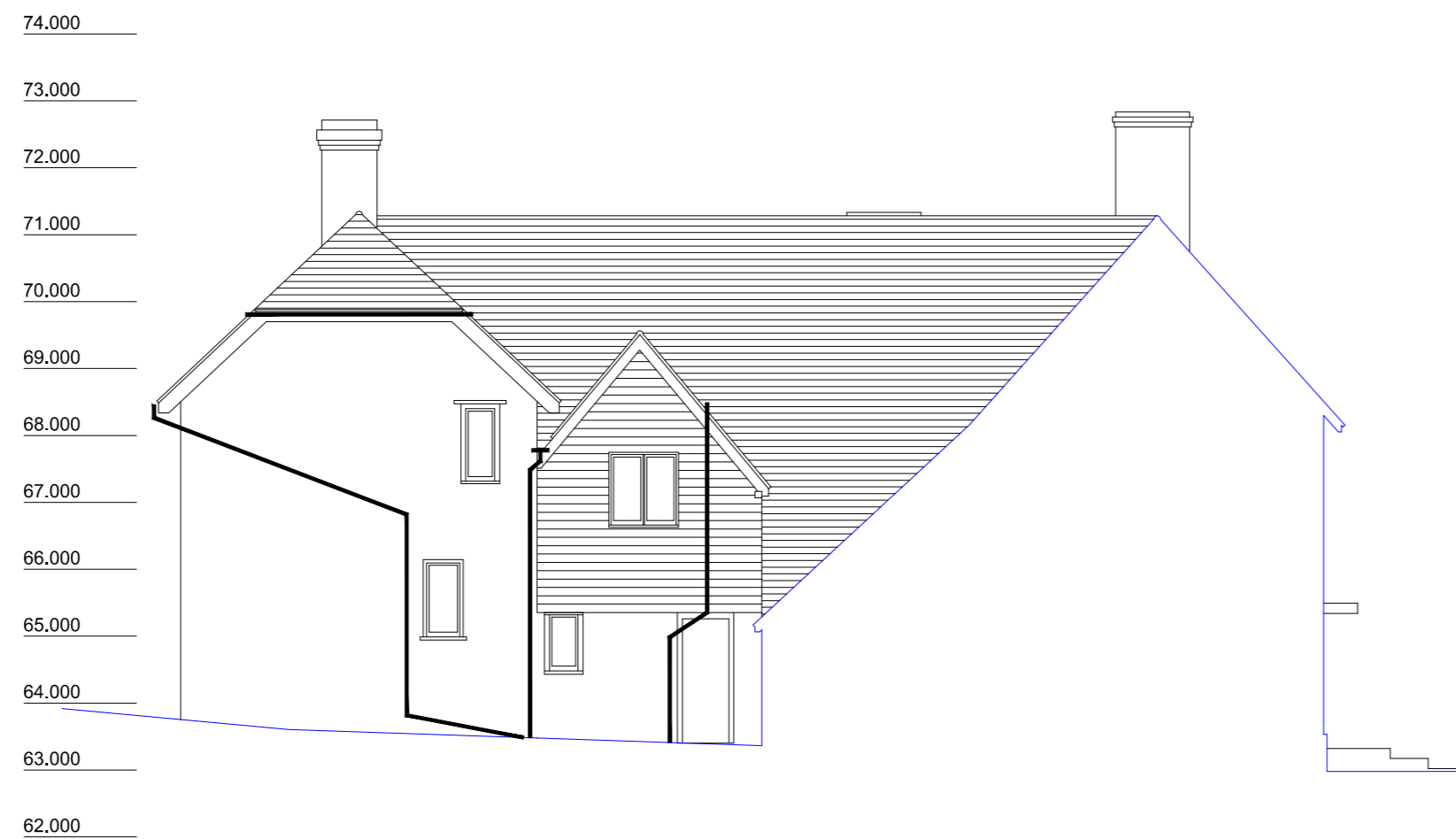
elevation F - South B