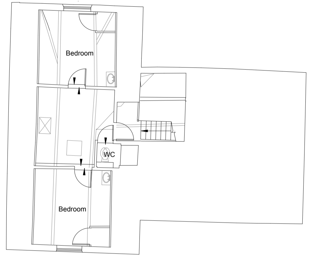
03 PROPOSED ATTIC LAYOUT (NO CHANGE) 1:100