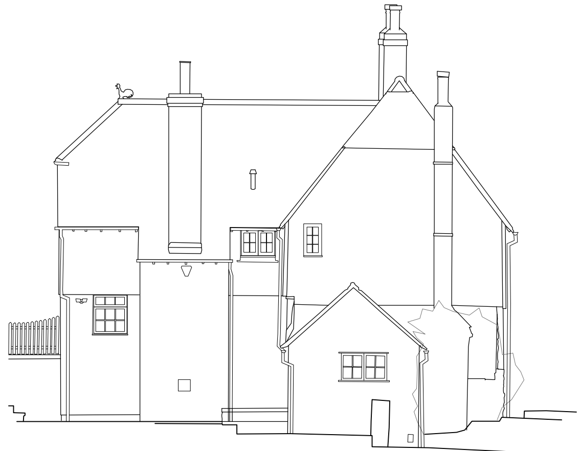
EXISTING SIDE ELEVATION 1:100