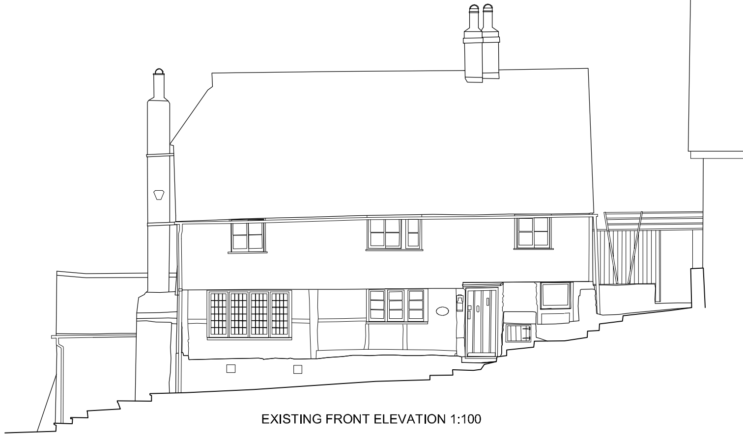
EXISTING FRONT ELEVATION 1:100