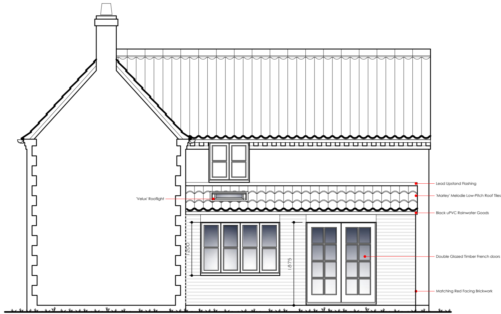
Proposed West Elevation 1:50