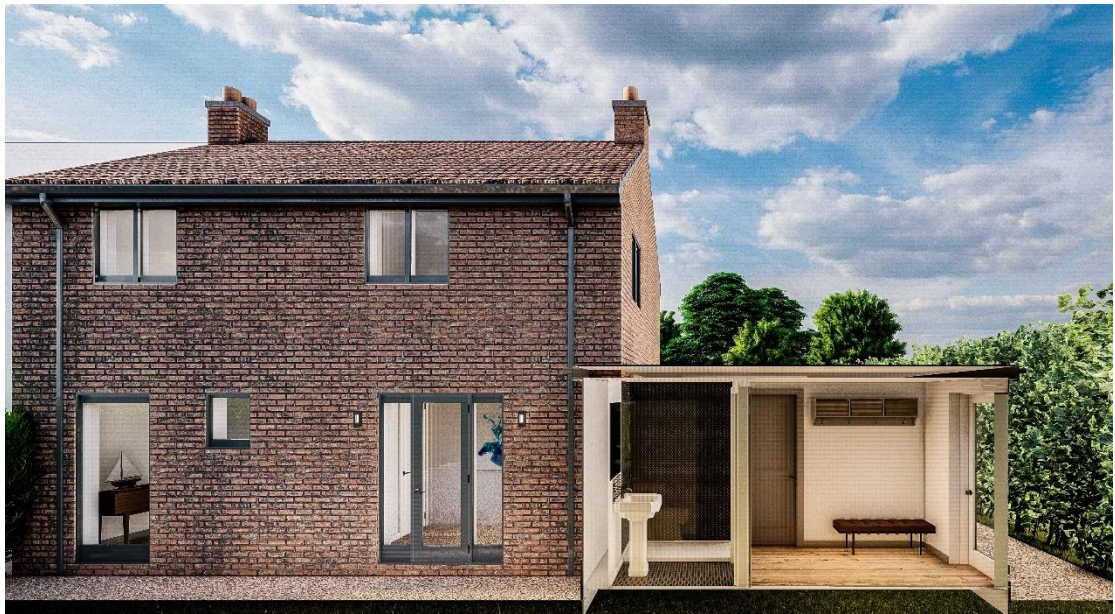
Front Elevation Section