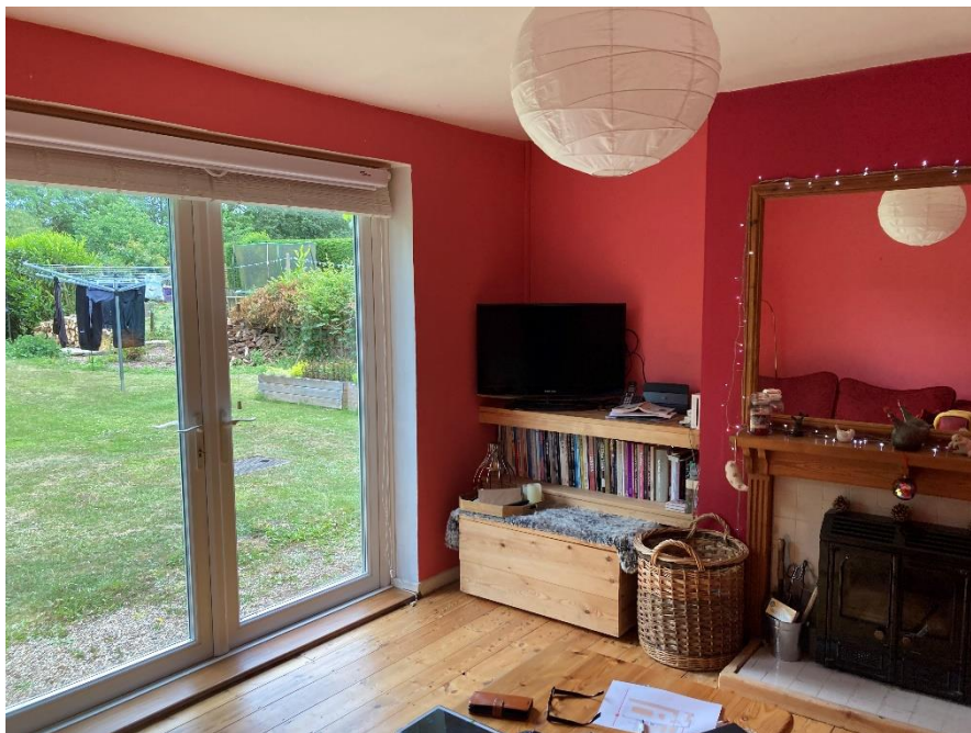
Proposed access from sitting room to the left of fireplace to new extension