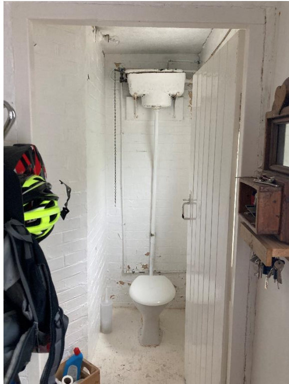
Existing original WC to be replaced with up-to-date shower room, toilet and wash basin