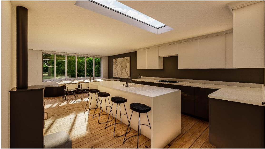
Internal View of Kitchen / Dining Room