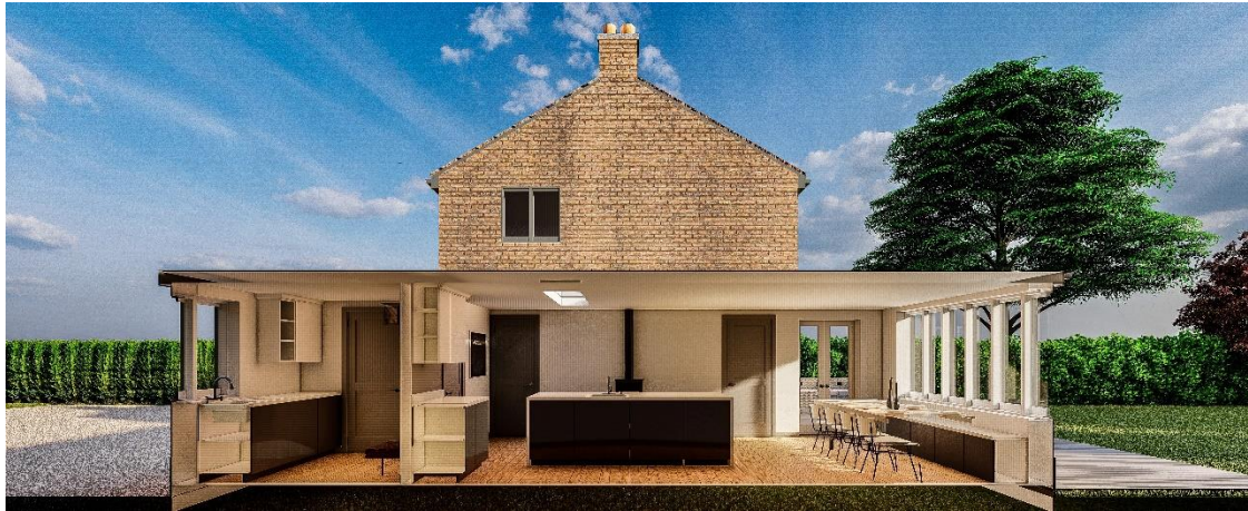
Side Elevation Section