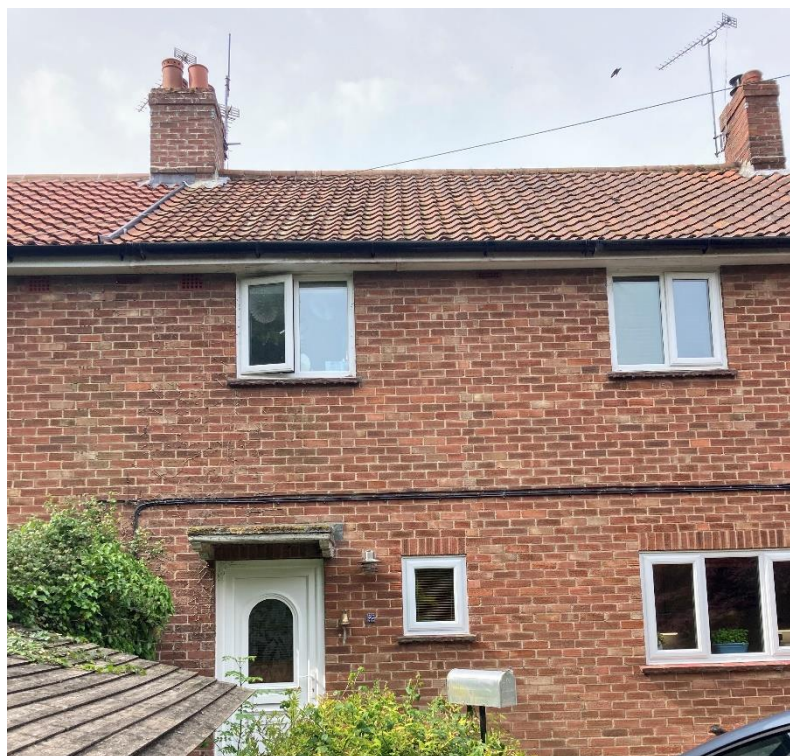
Front Elevation (Front Door to be replaced with glass window and front window to be replaced by front door with side lights)