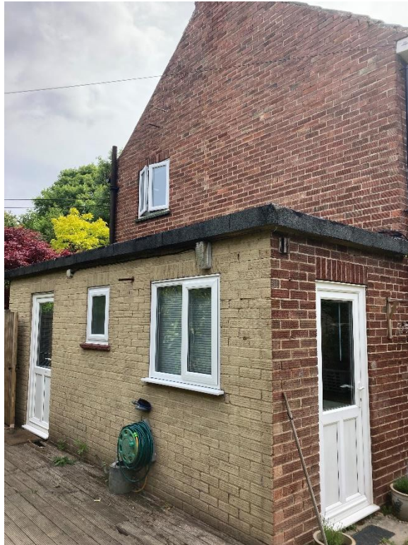
South West Elevation (existing single brick extension to be demolished and replaced with a new modern extension)