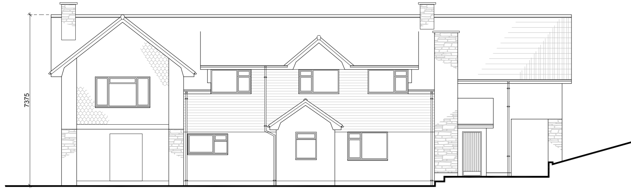
Elevation facing North West - As Existing