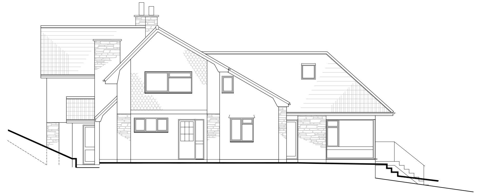
Elevation facing South West - As Existing