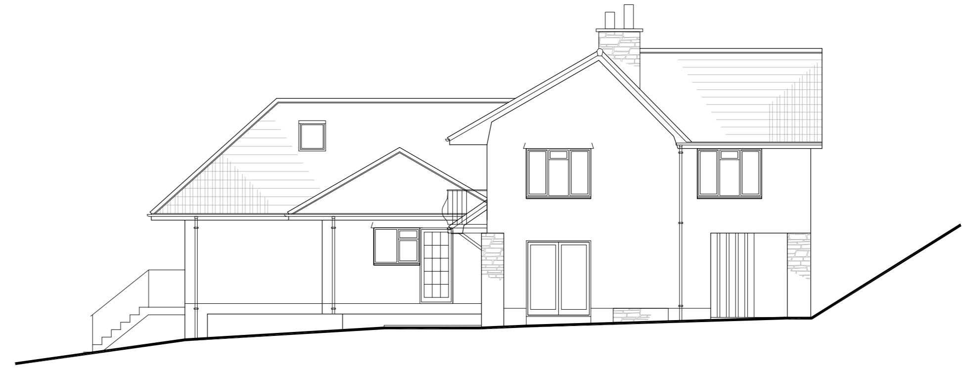
Elevation facing North East - As Existing