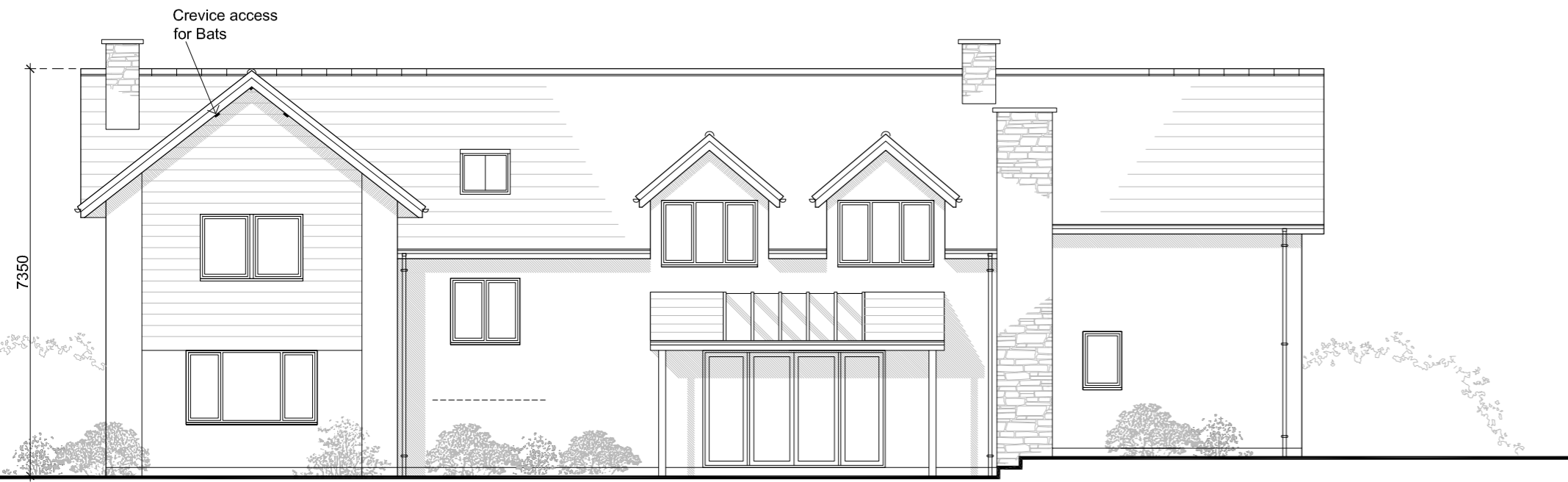
Elevation facing North West - As Proposed Scale 1:100