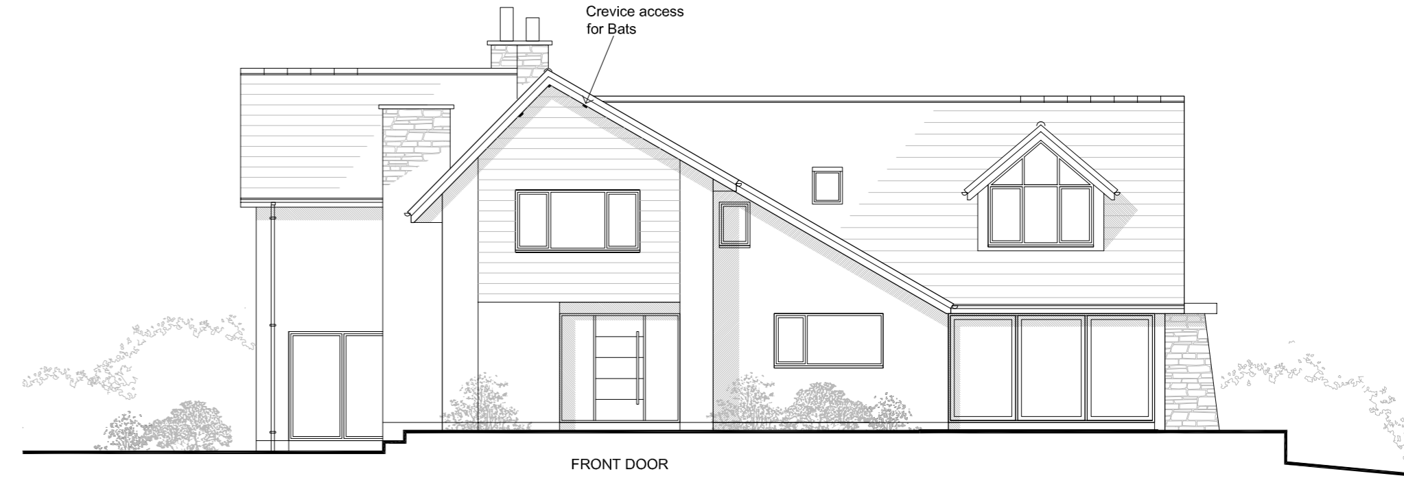
Elevation facing South West - As Proposed Scale 1:100