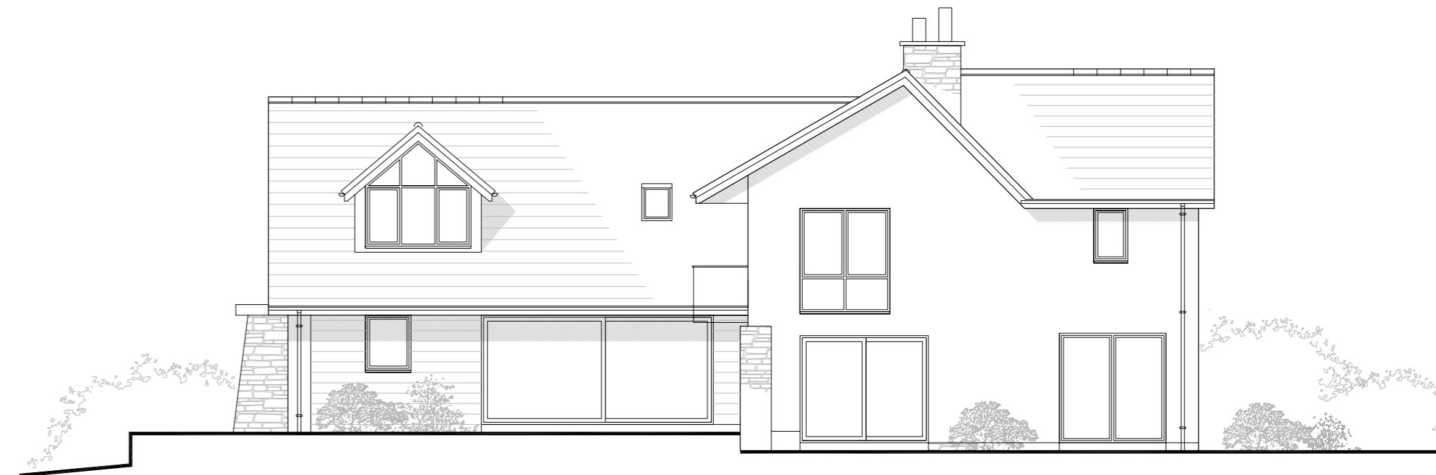
Elevation facing North East - As Proposed Scale 1:100