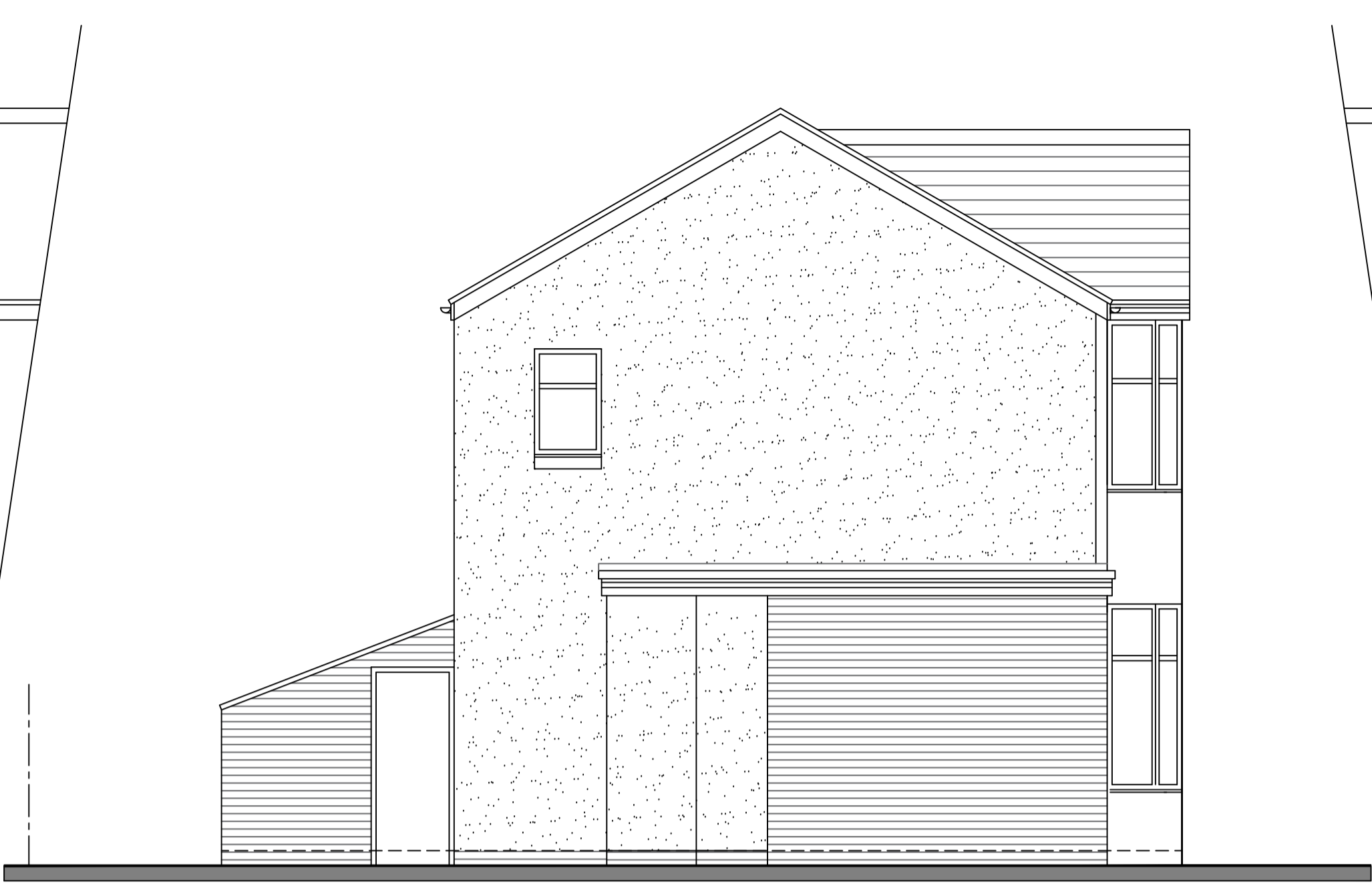
1:50 PROPOSED SIDE ELEVATION To Hemingway