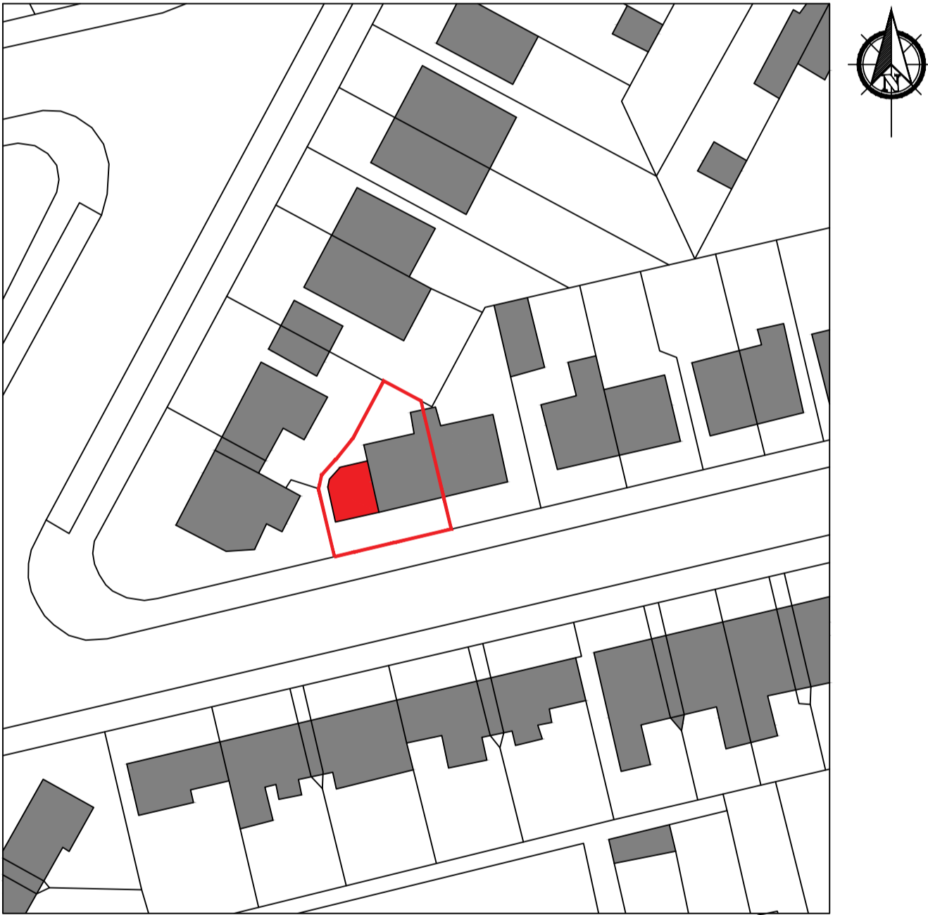
1:500 PROPOSED SITE PLAN

PROPOSED REPLACEMENT GARAGE 61 HEMMINGWAY, BLACKPOOL. FY4 3DR