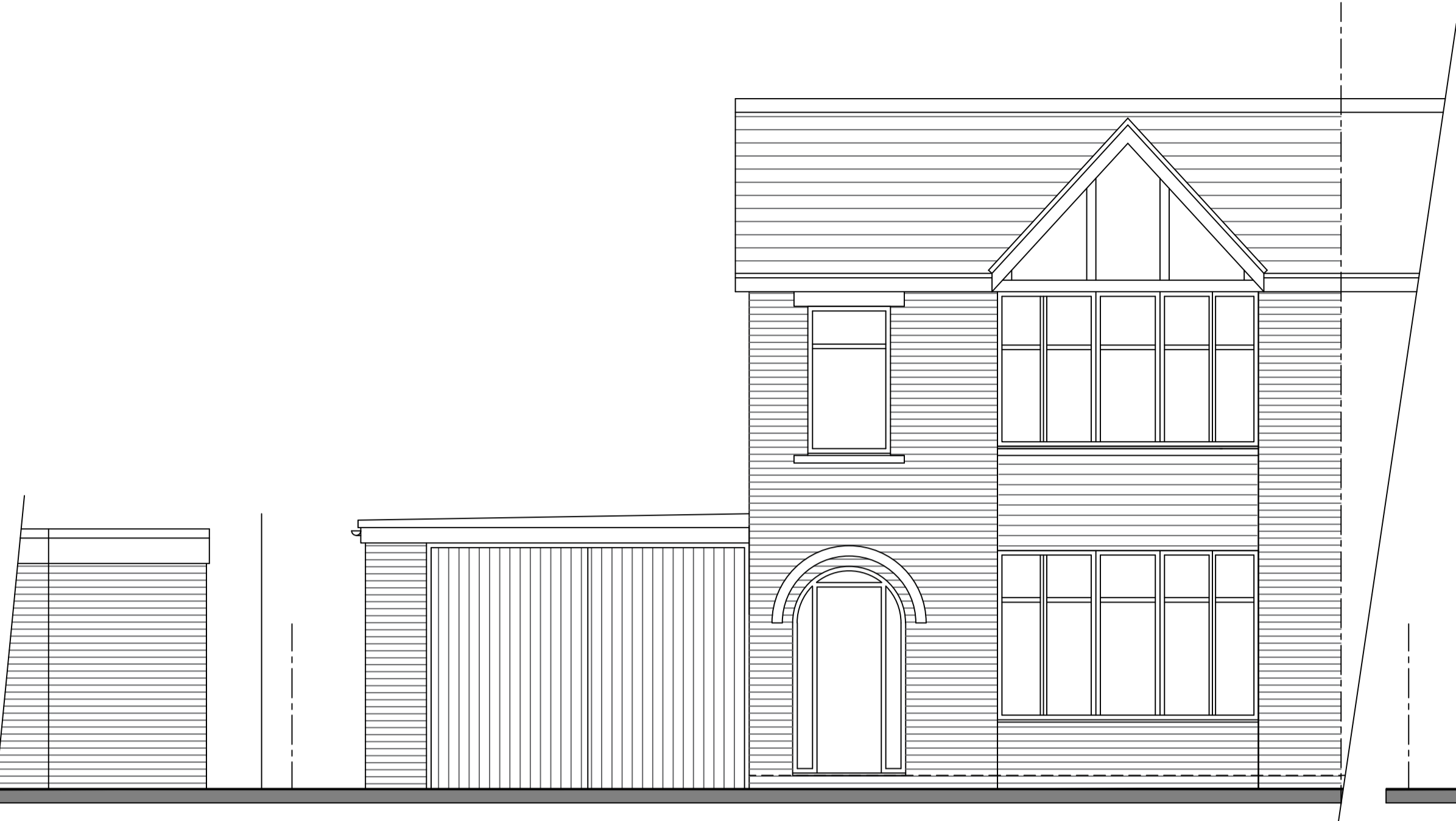
1:50 PROPOSED FRONT ELEVATION To Hemingway