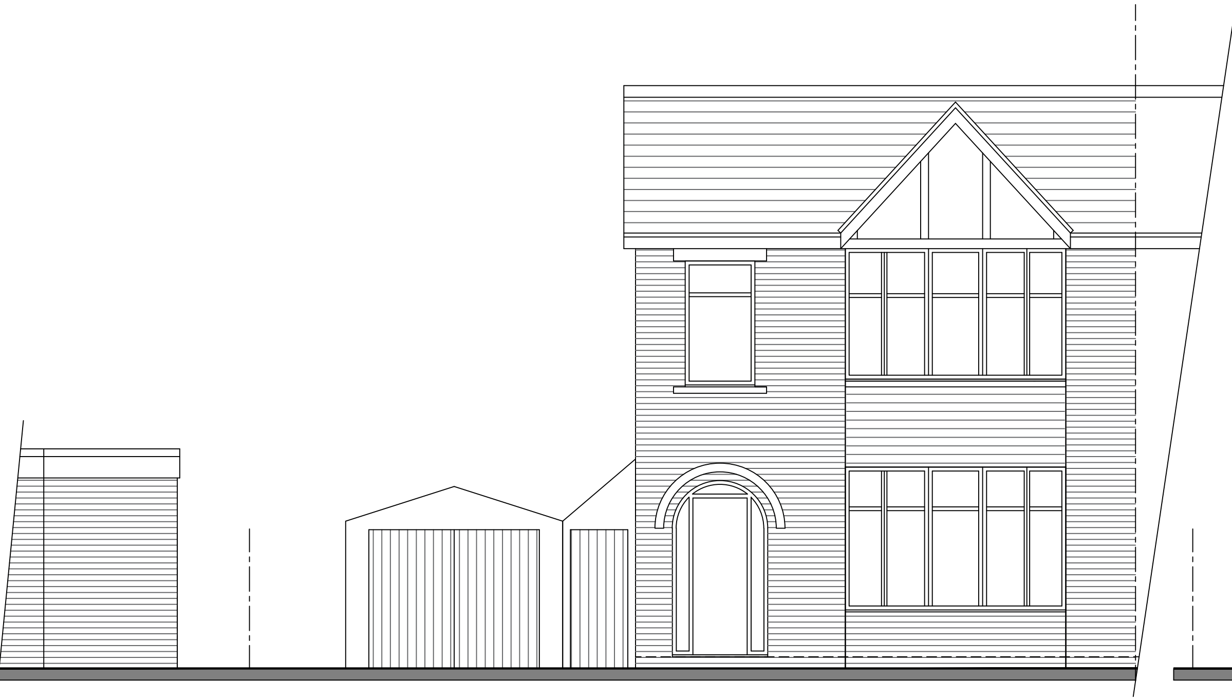
1:50 EXISTING FRONT ELEVATION To Hemingway