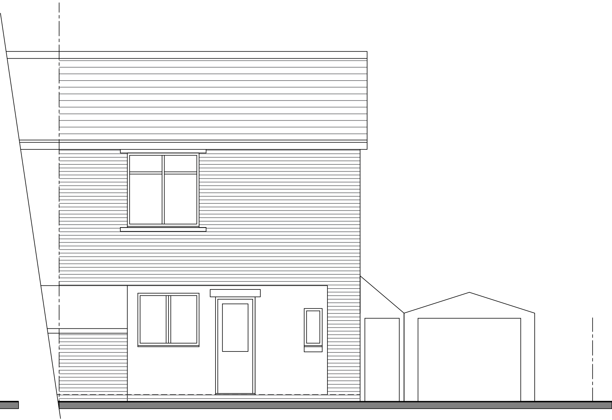
1:50 EXISTING REAR ELEVATION To Rear Garden