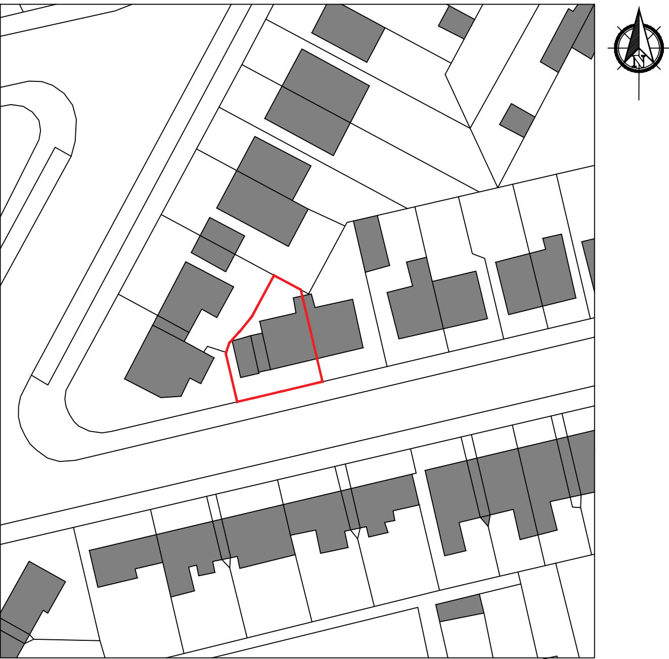
1:500 EXISTING SITE PLAN

THIS DRAWING AND ITS CONTENTS ARE AND REMAIN THE COPYRIGHT OF LINDSAY F ORAM CHARTERED ARCHITECT LIMITED. DO NOT SCALE. IF IN DOUBT SEEK CLARIFICATION.