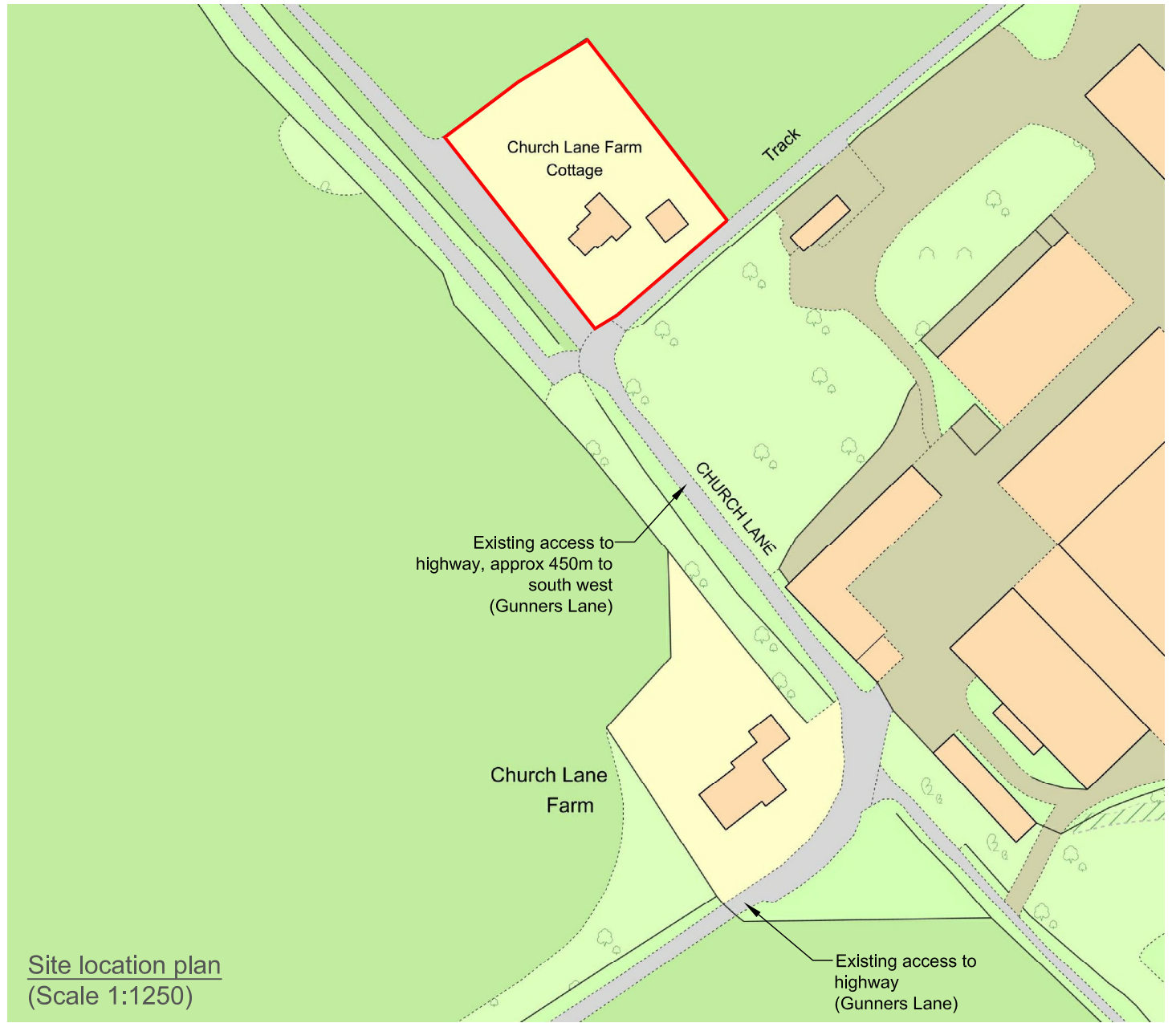
Site location plan (Scale 1:1250)