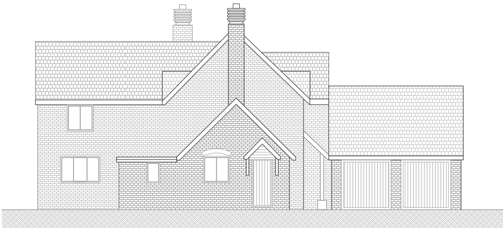
South west elevation (Scale 1:100)