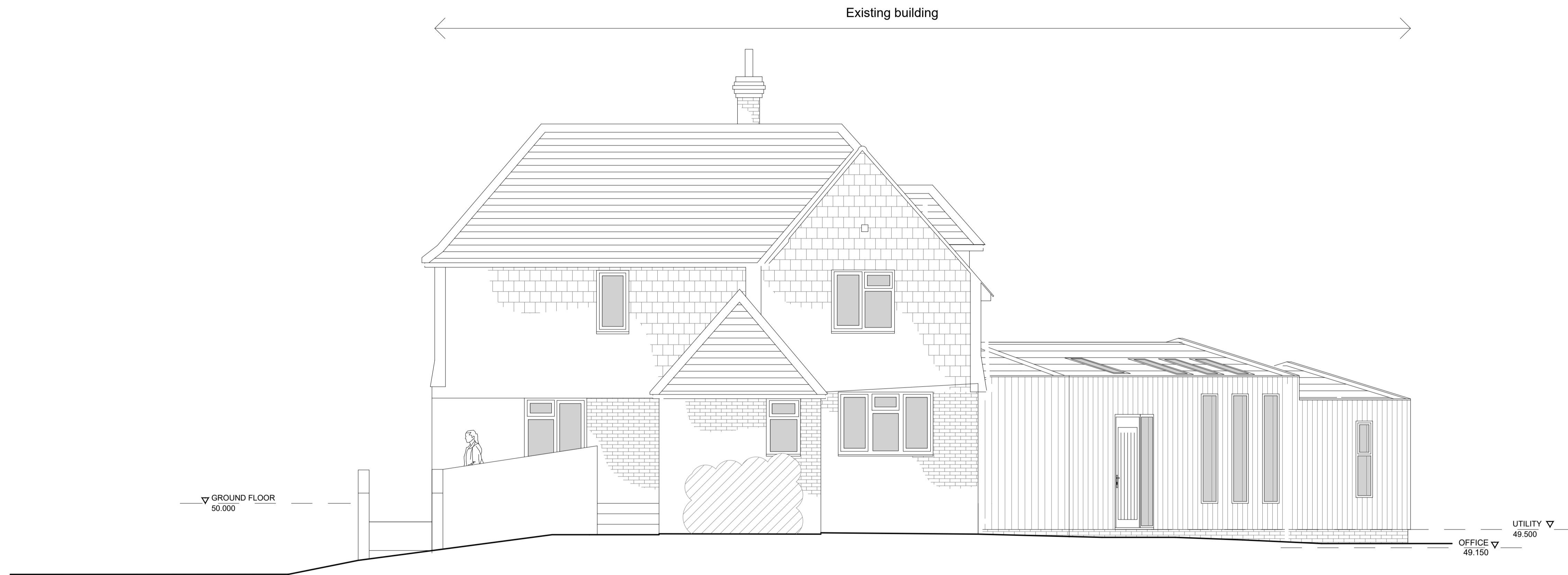
AS EXISTING FRONT ELEVATION (E) 1:50 @ A1