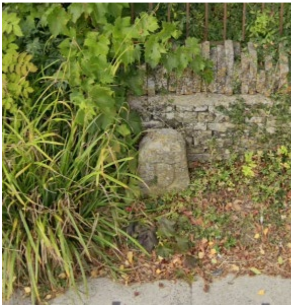
The listed item