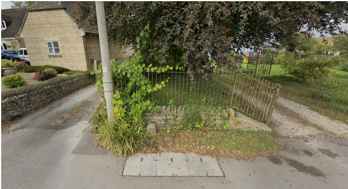
Listed item in wider context.