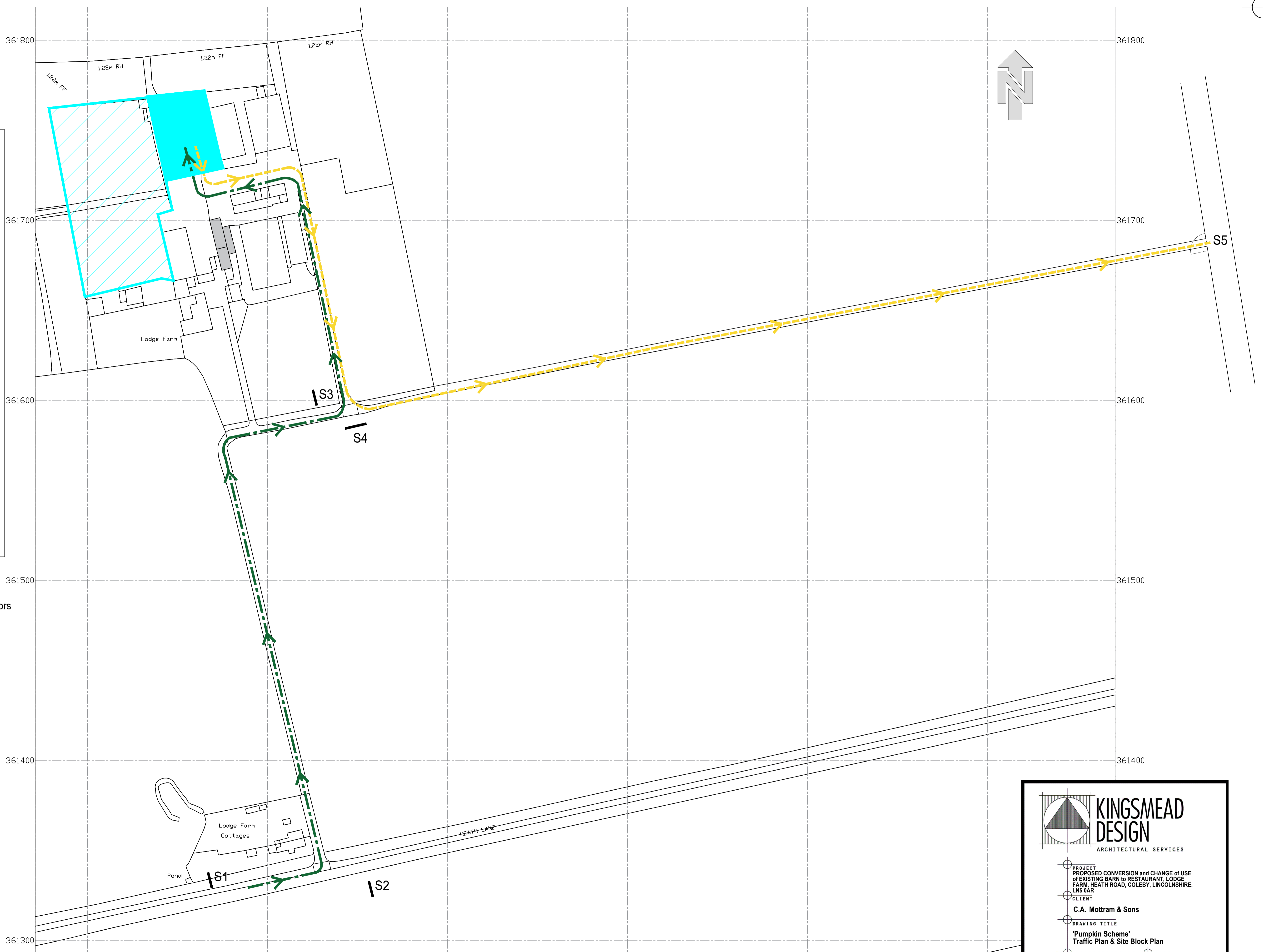
Site Block Plan (Scale 1:1250 at A1; 1:2500 at A3)