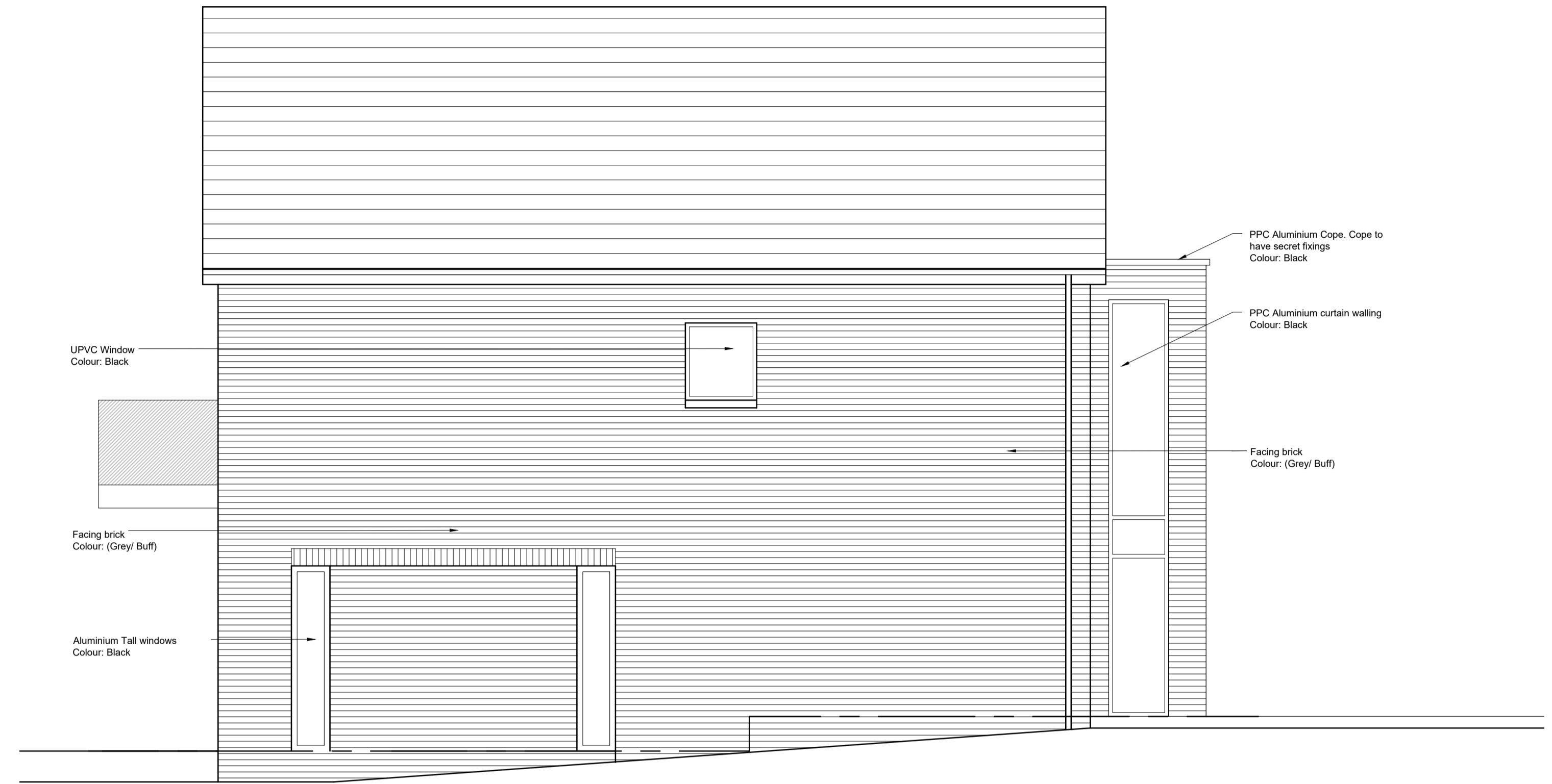
GABLE ELEVATION (1:50)