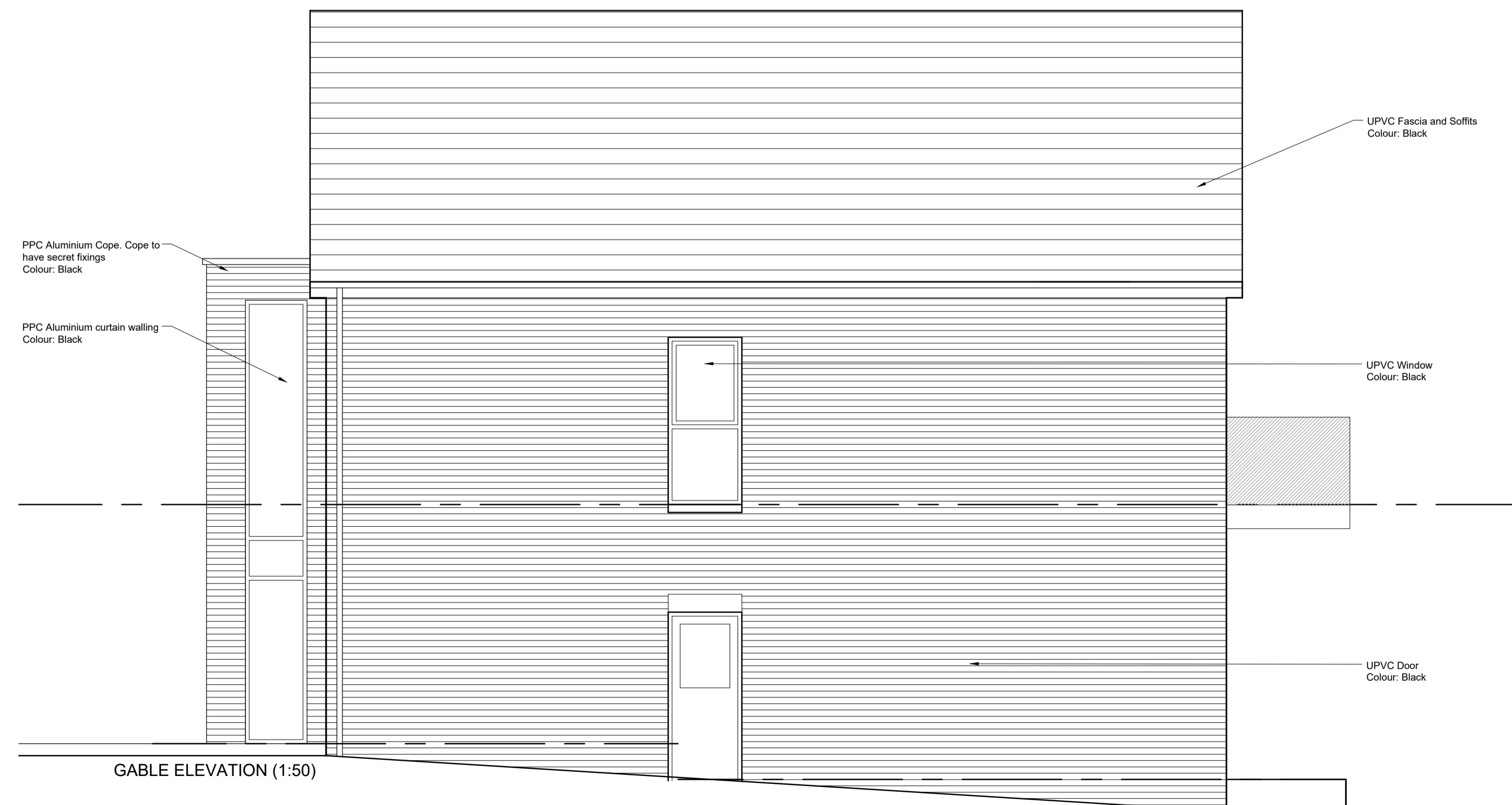
GABLE ELEVATION (1:50)