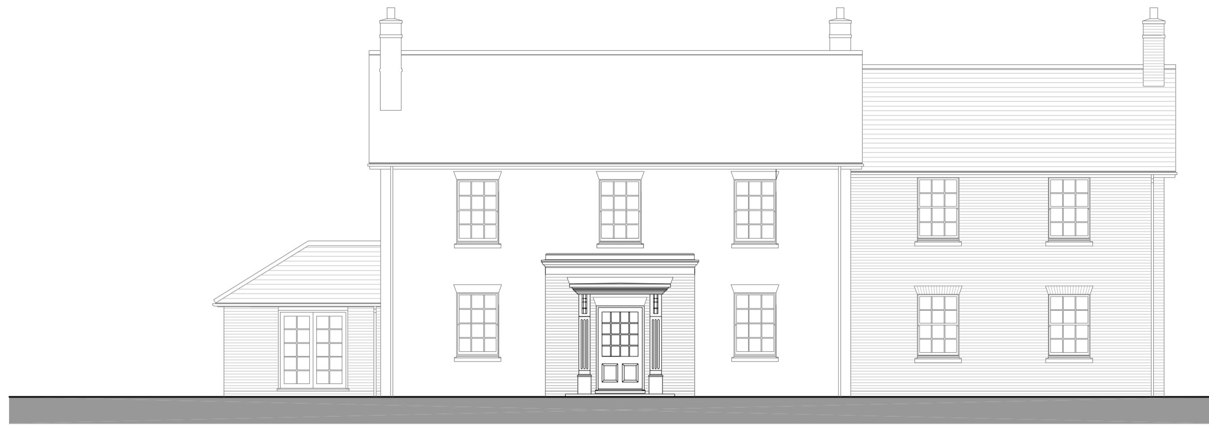
Proposed Front Elevation (South-East)