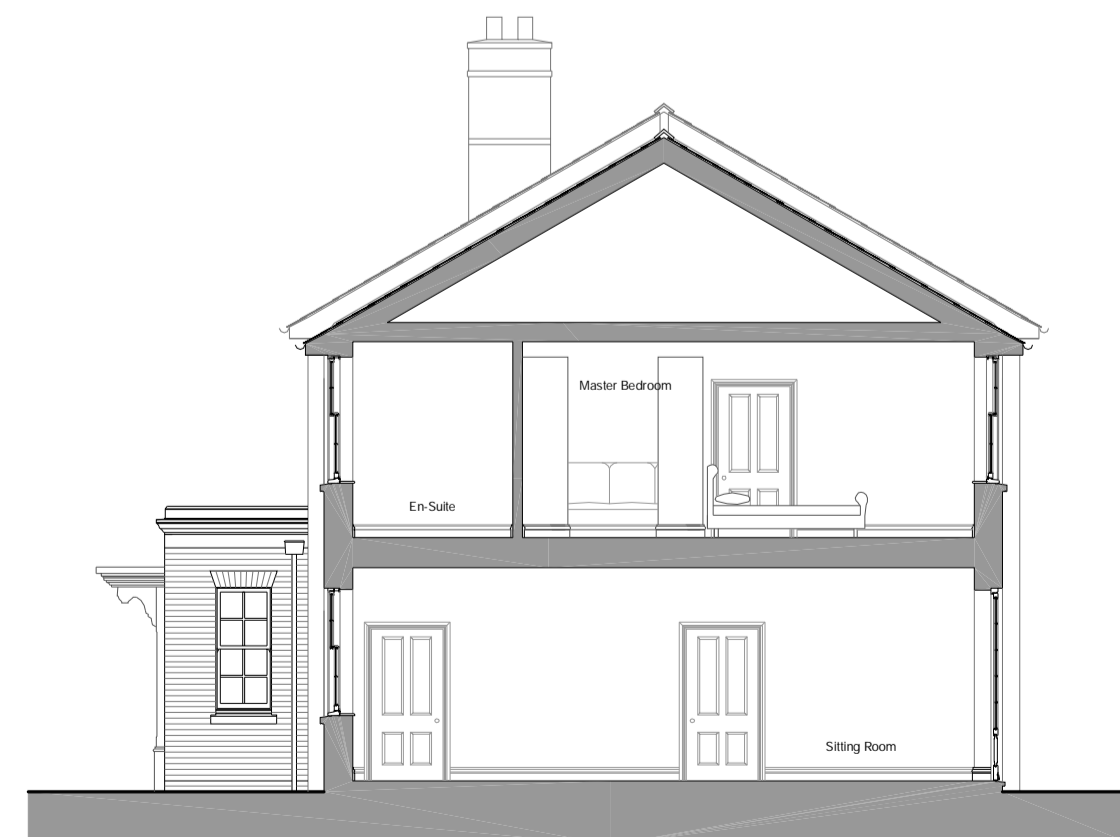
Proposed Section A - A - Through Extension