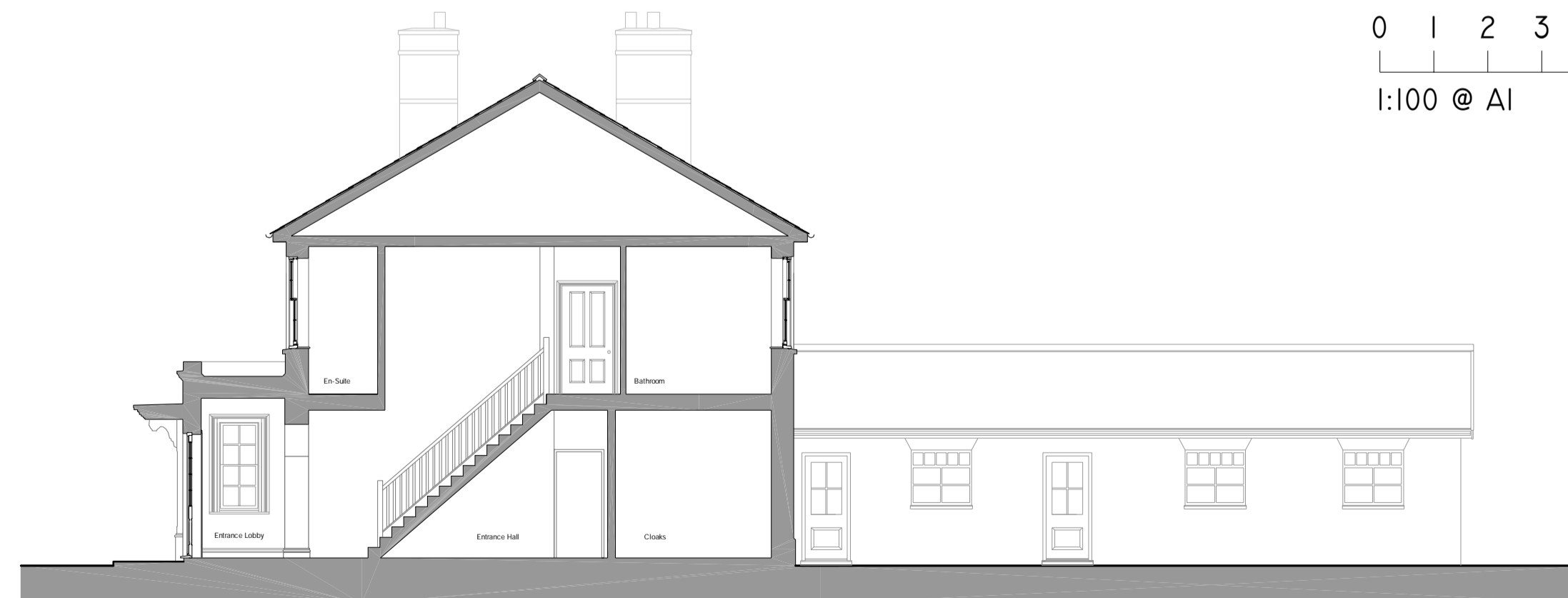
Proposed Section B - B - Through Porch