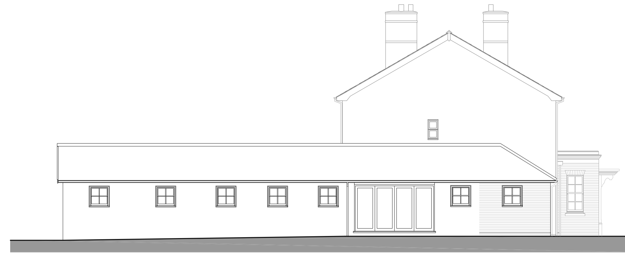
Proposed Side Elevation (South-West)