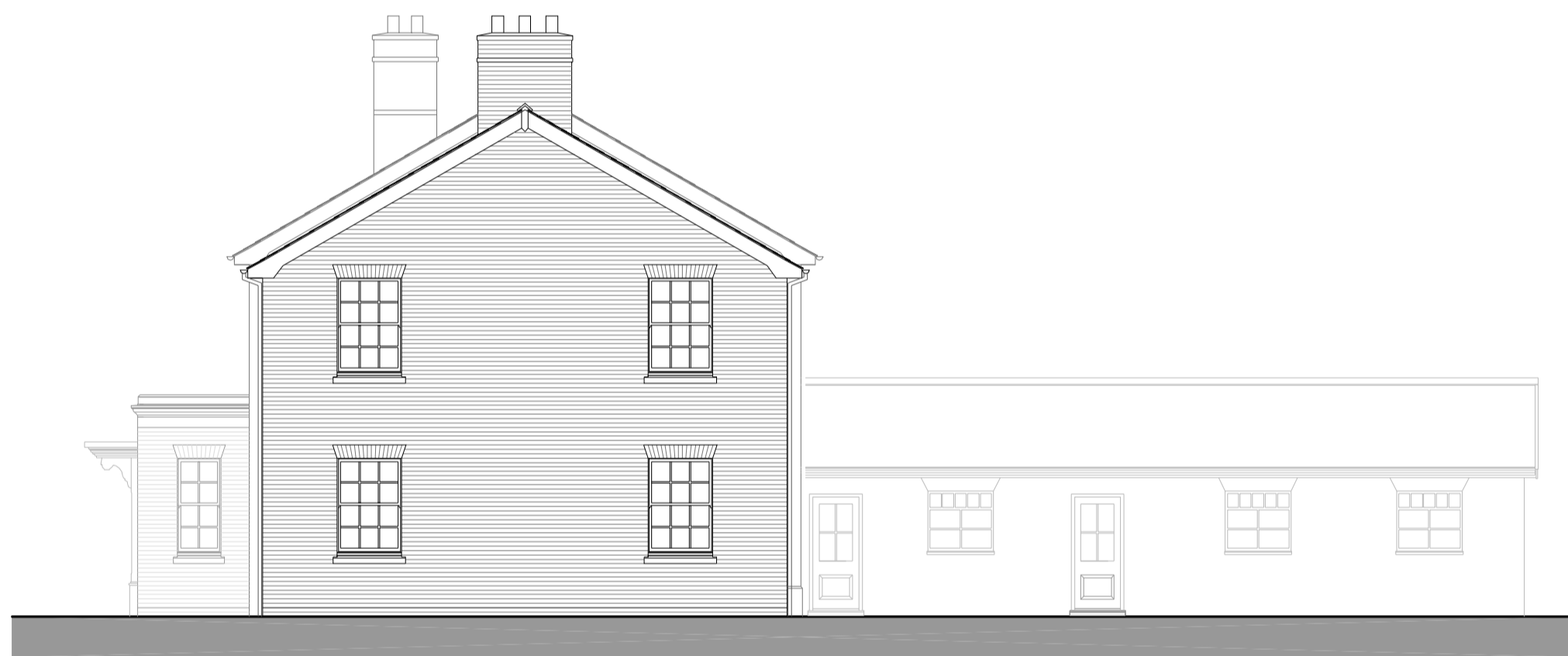
Proposed Side Elevation (North-East)