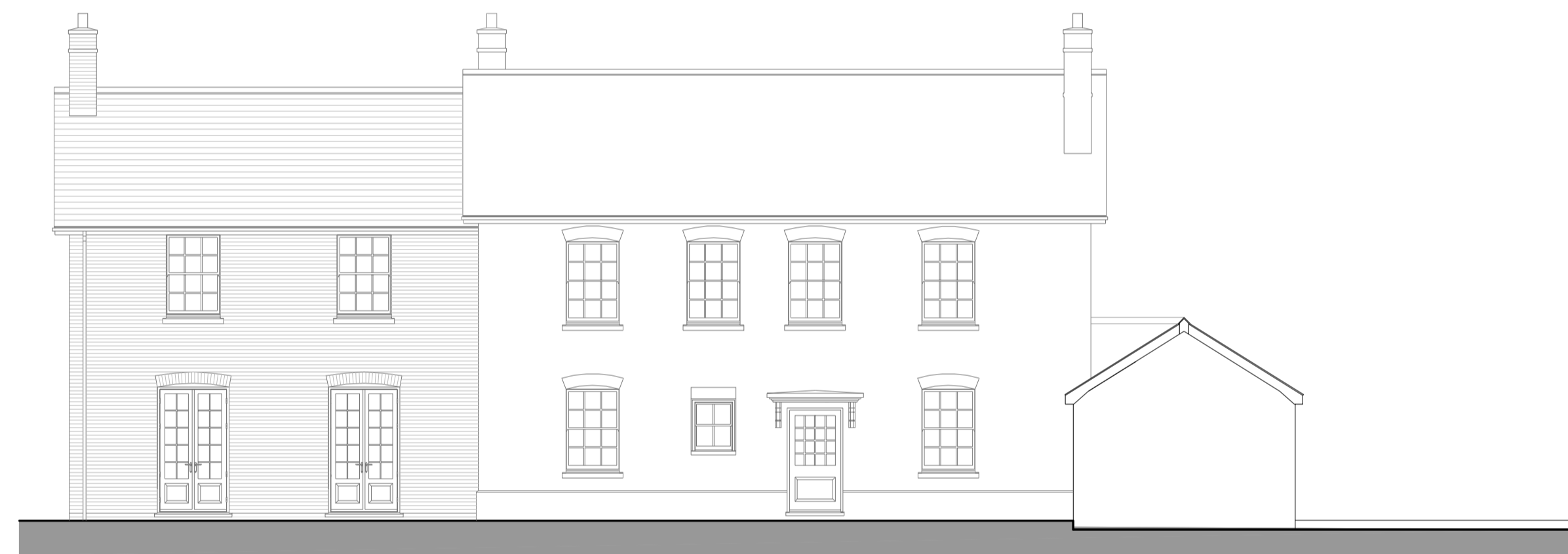
Proposed Rear Elevation (North-West)