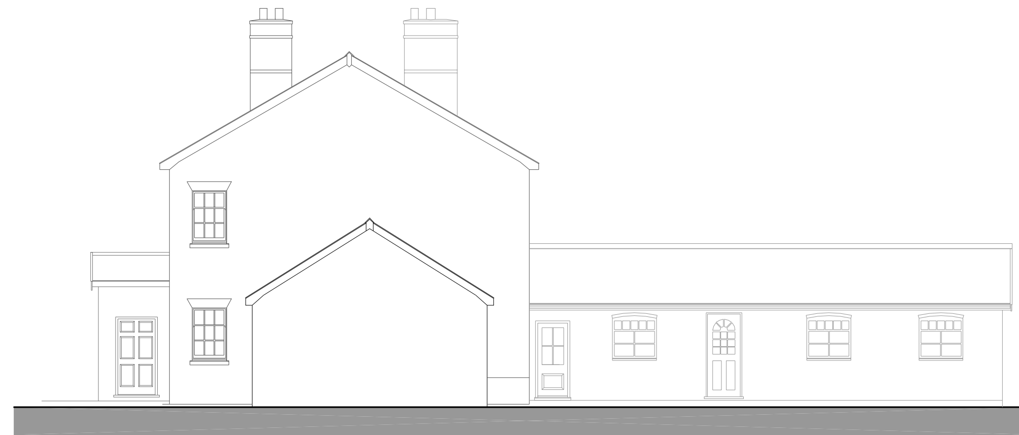
Existing Side Elevation (North-East)