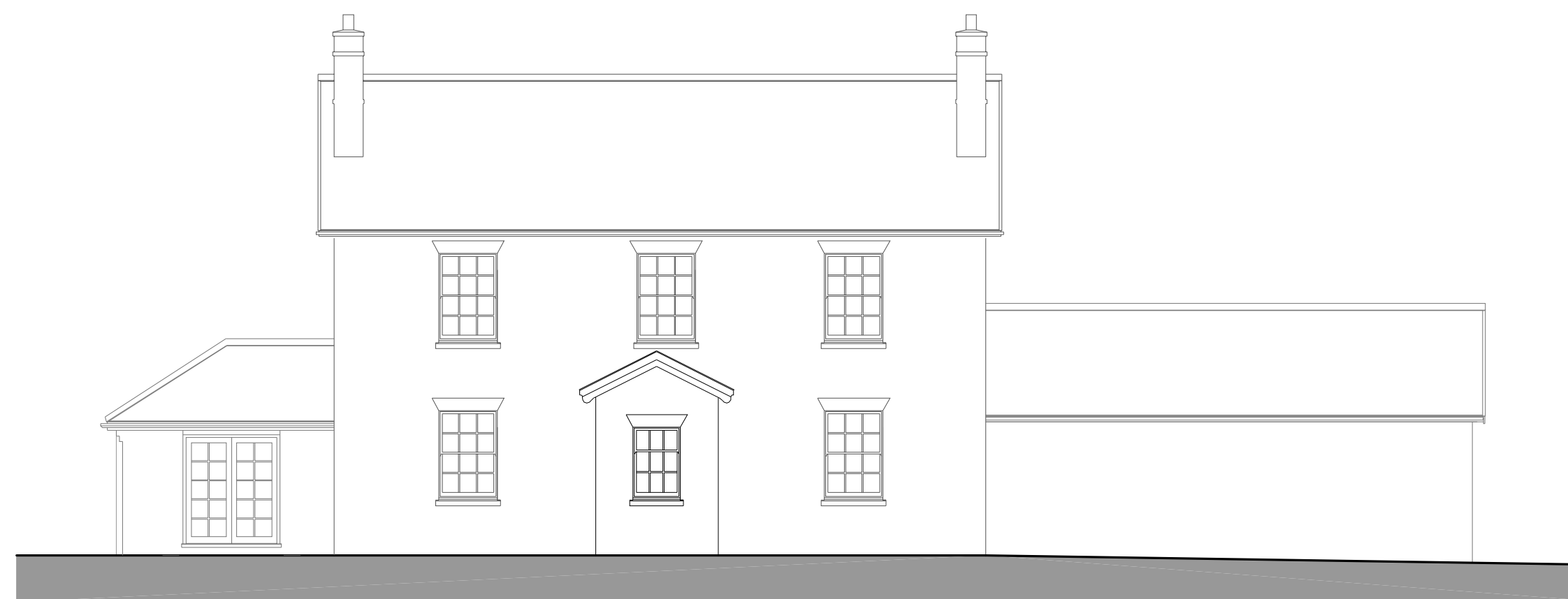
Existing Front Elevation (South-East)