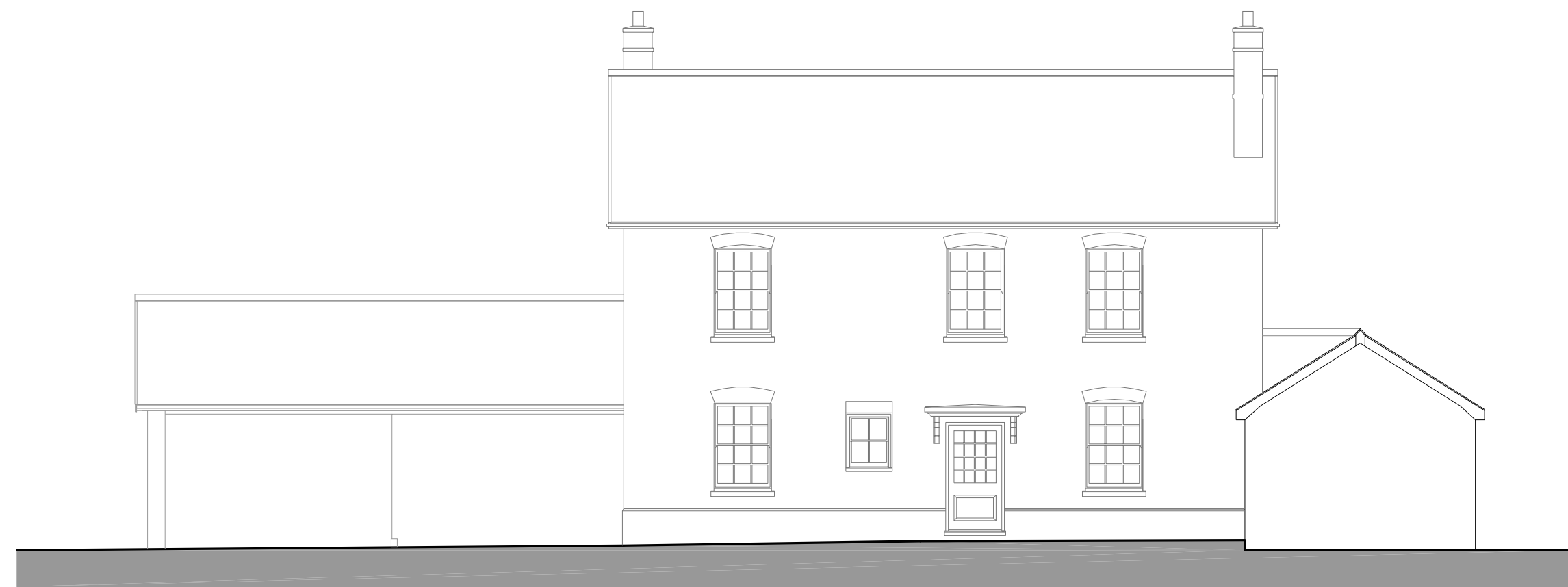
Existing Rear Elevation (North-West)