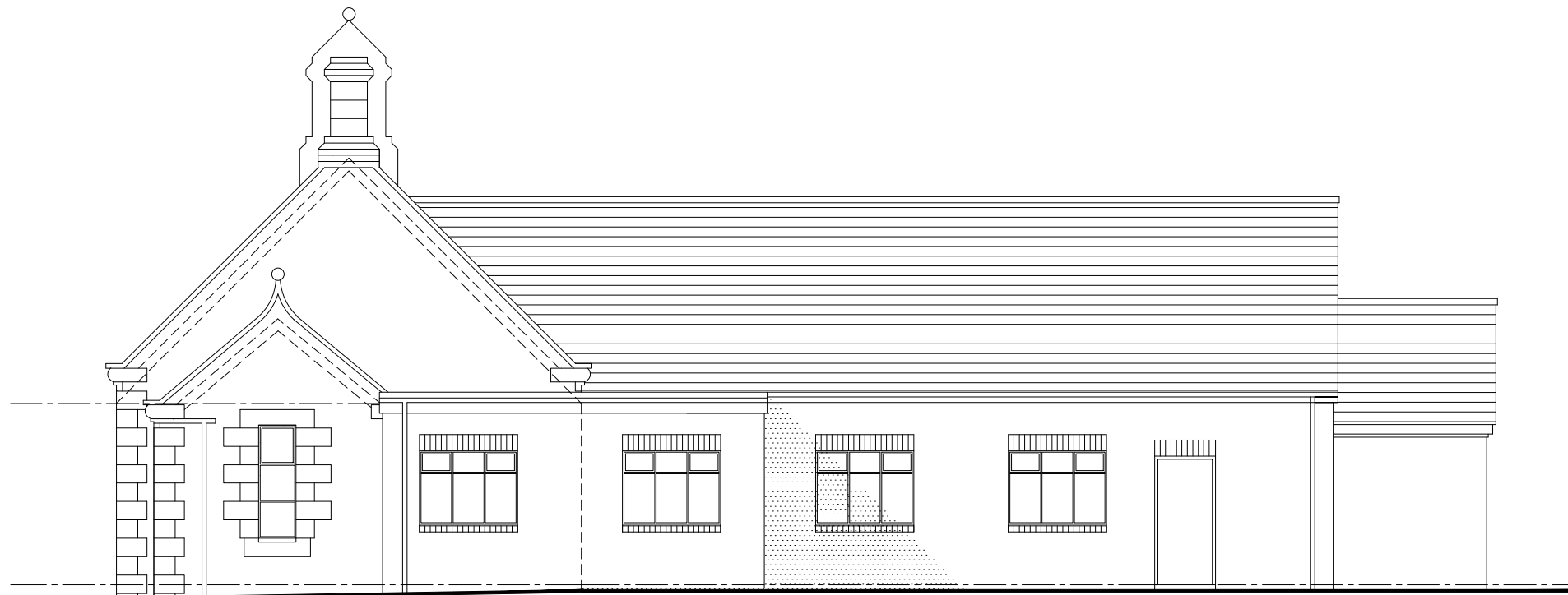
Side South Facing Elevation Existing