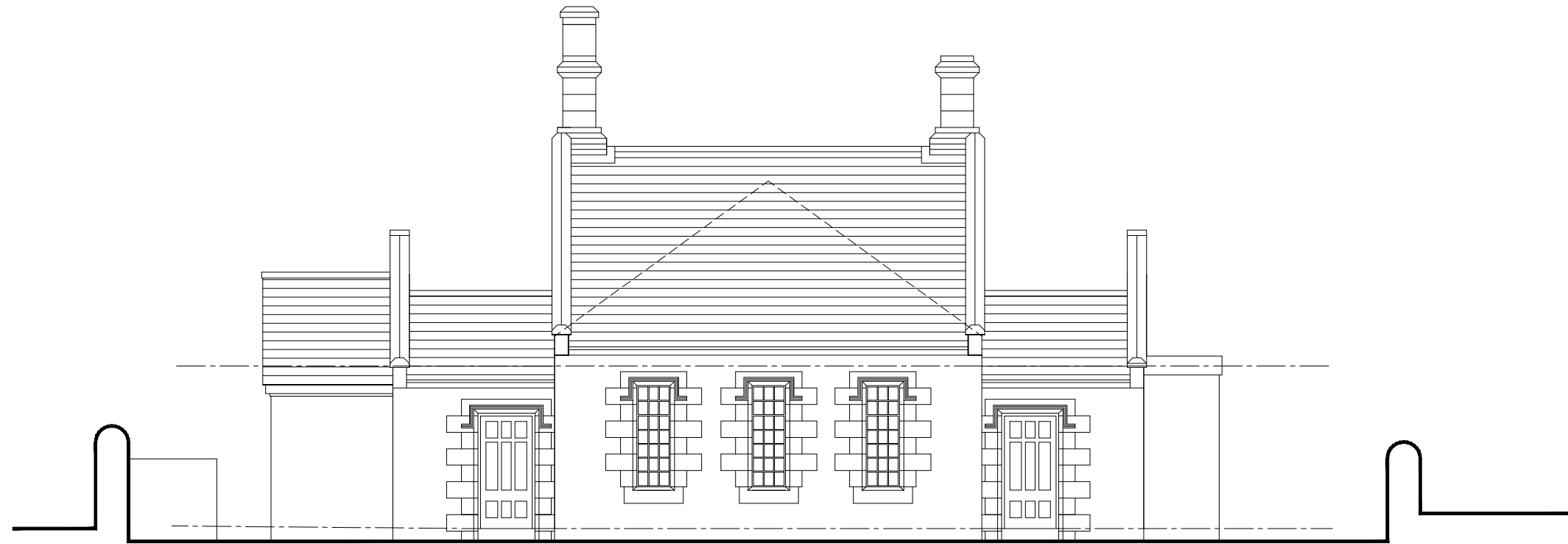
Front West Facing Elevation Existing - ( No change)