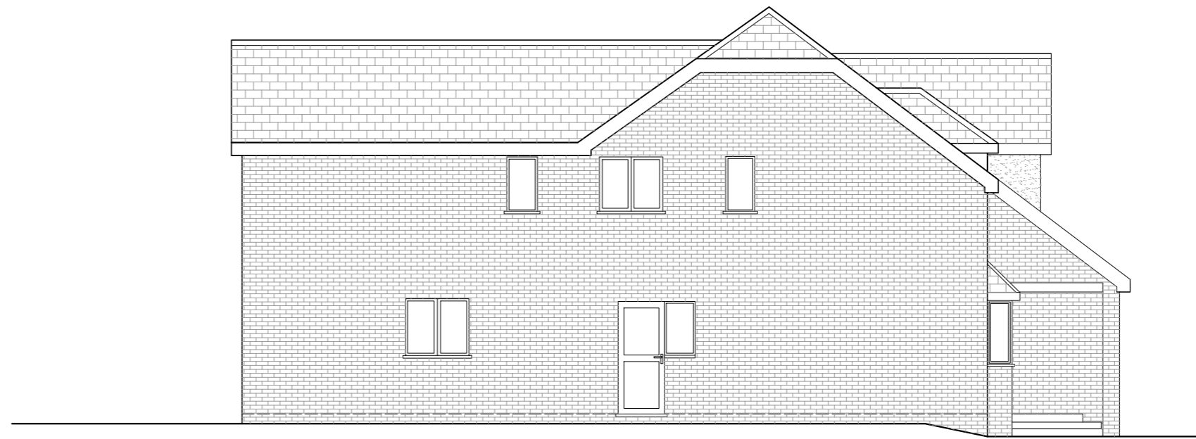
PROPOSED LEFT ELEVATION SCALE 1:100 0 1 2 3 4 5m