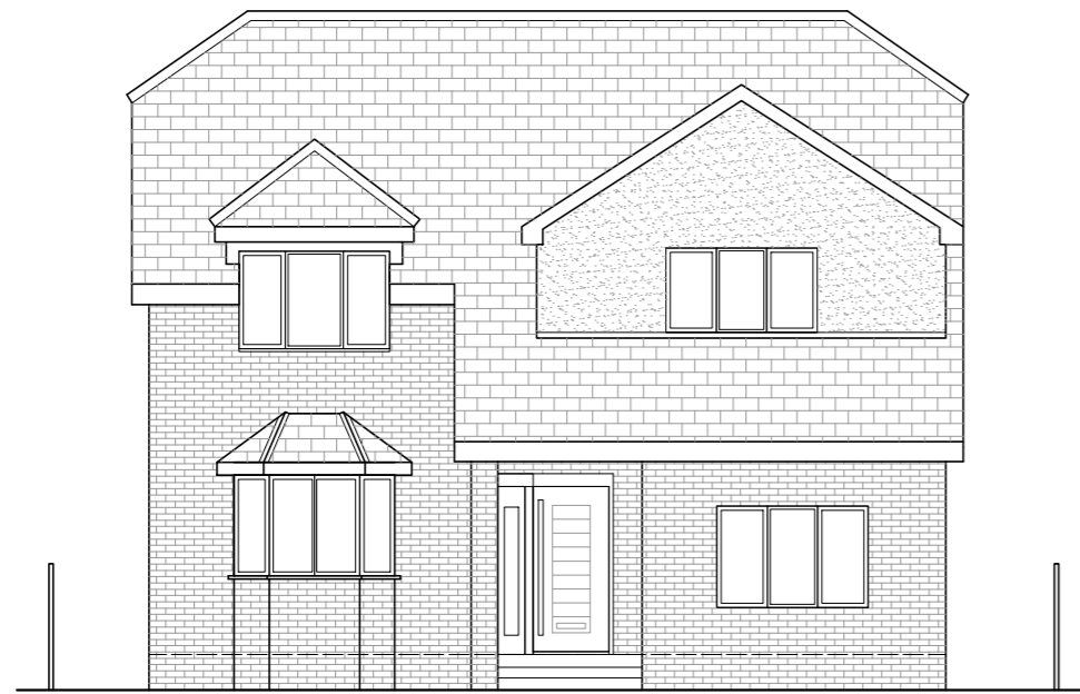
PROPOSED FRONT ELEVATION SCALE 1:100 0 1 2 3 4 5m

NOTES: Do not scale this drawing. Work to figured dimensions only. Check all dimensions on site. Confirm any discrepancies prior to commencement of work.