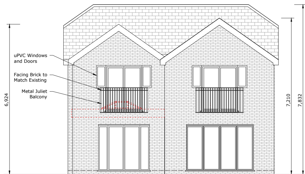
PROPOSED REAR ELEVATION SCALE 1:100 0 1 2 3 4 5m