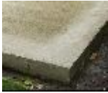
Shed base preparation and other information