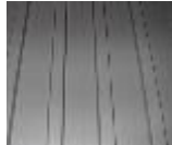
Close up photos