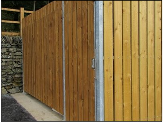
CYCLE STORAGE UNIT