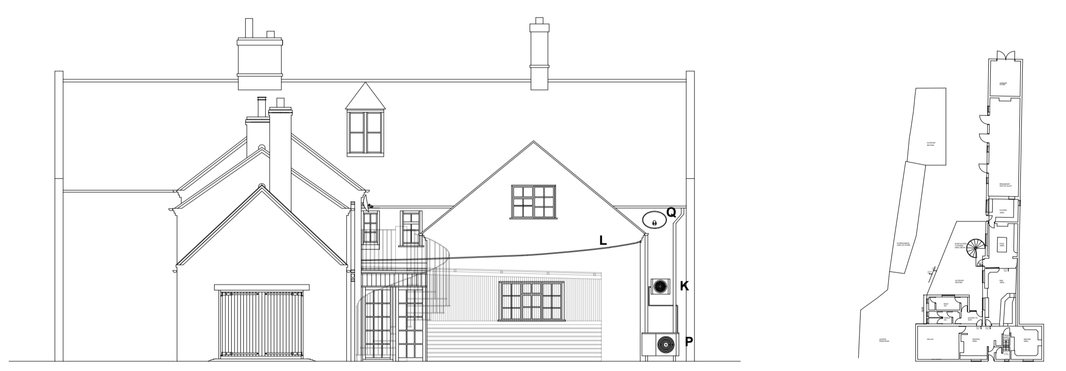
South Elevation @1:100