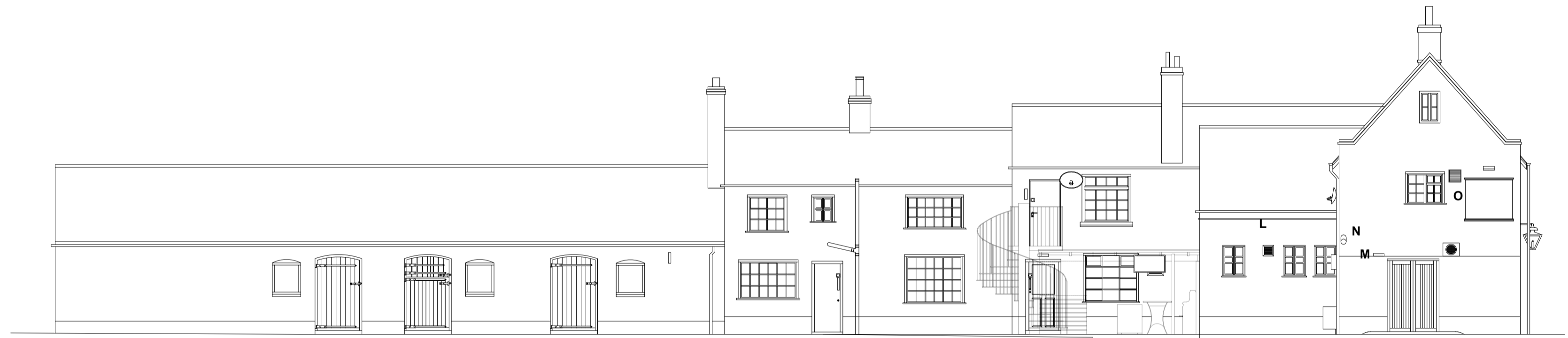
East Elevation @1:100