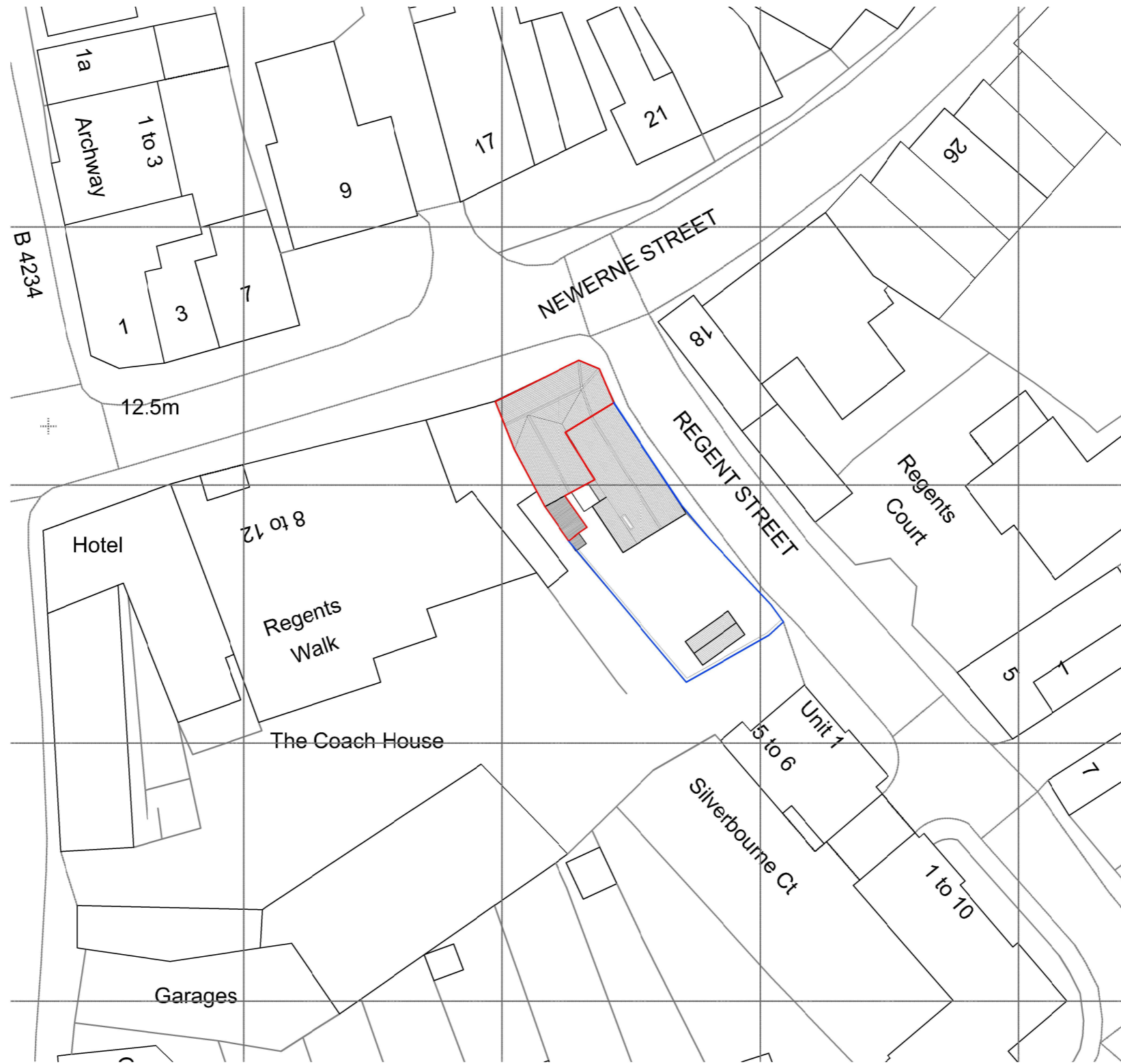
SITE BLOCK PLAN 1:500