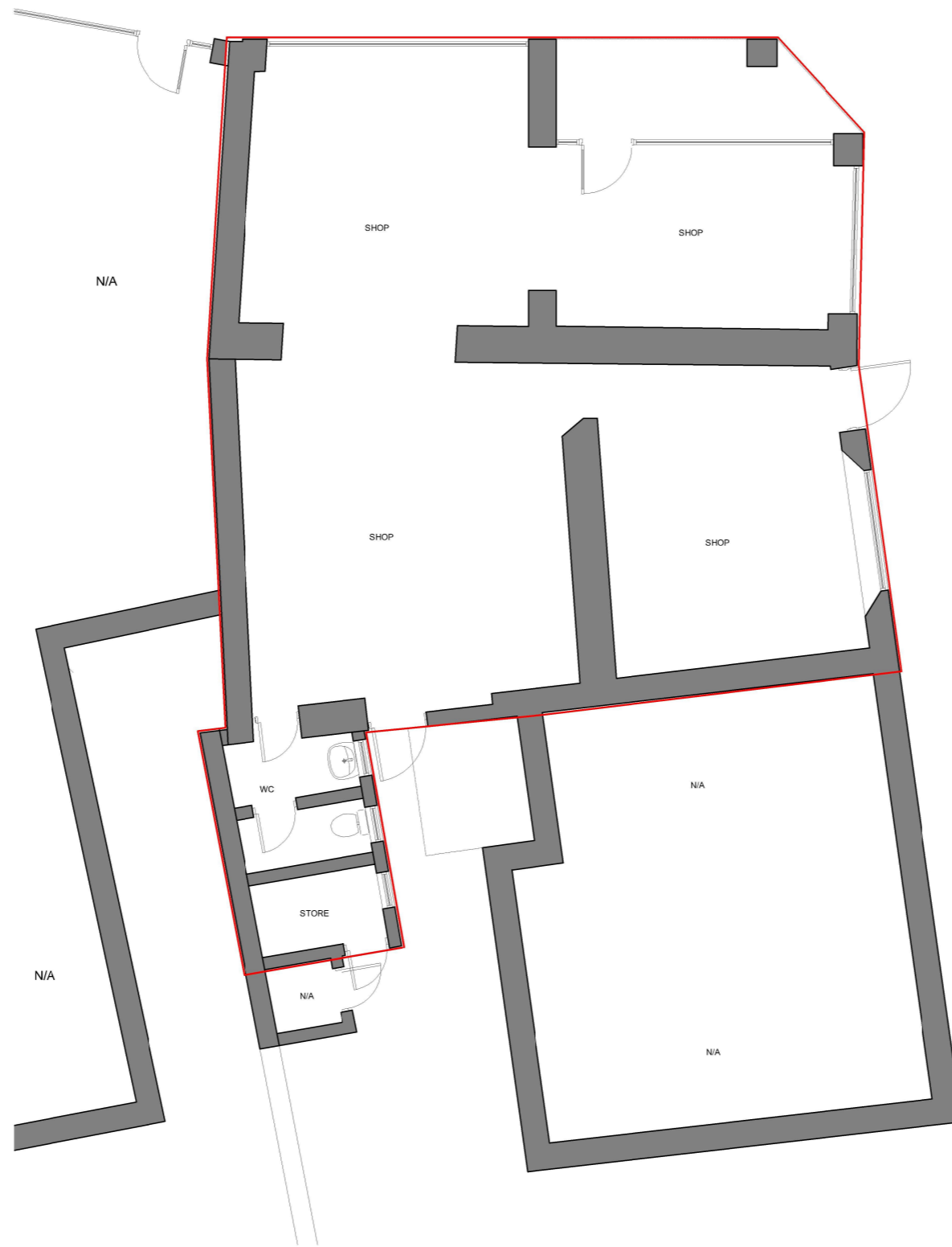
Existing Ground Floor Plan 1:100