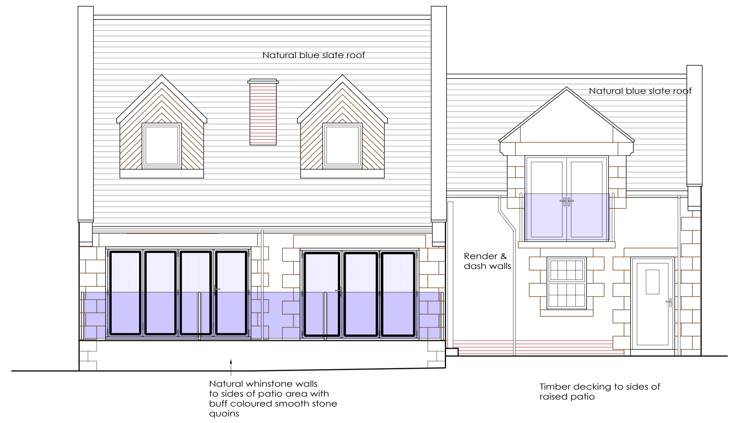
PROPOSED SOUTH ELEVATION - WITH PATIO BALLUSTRADING