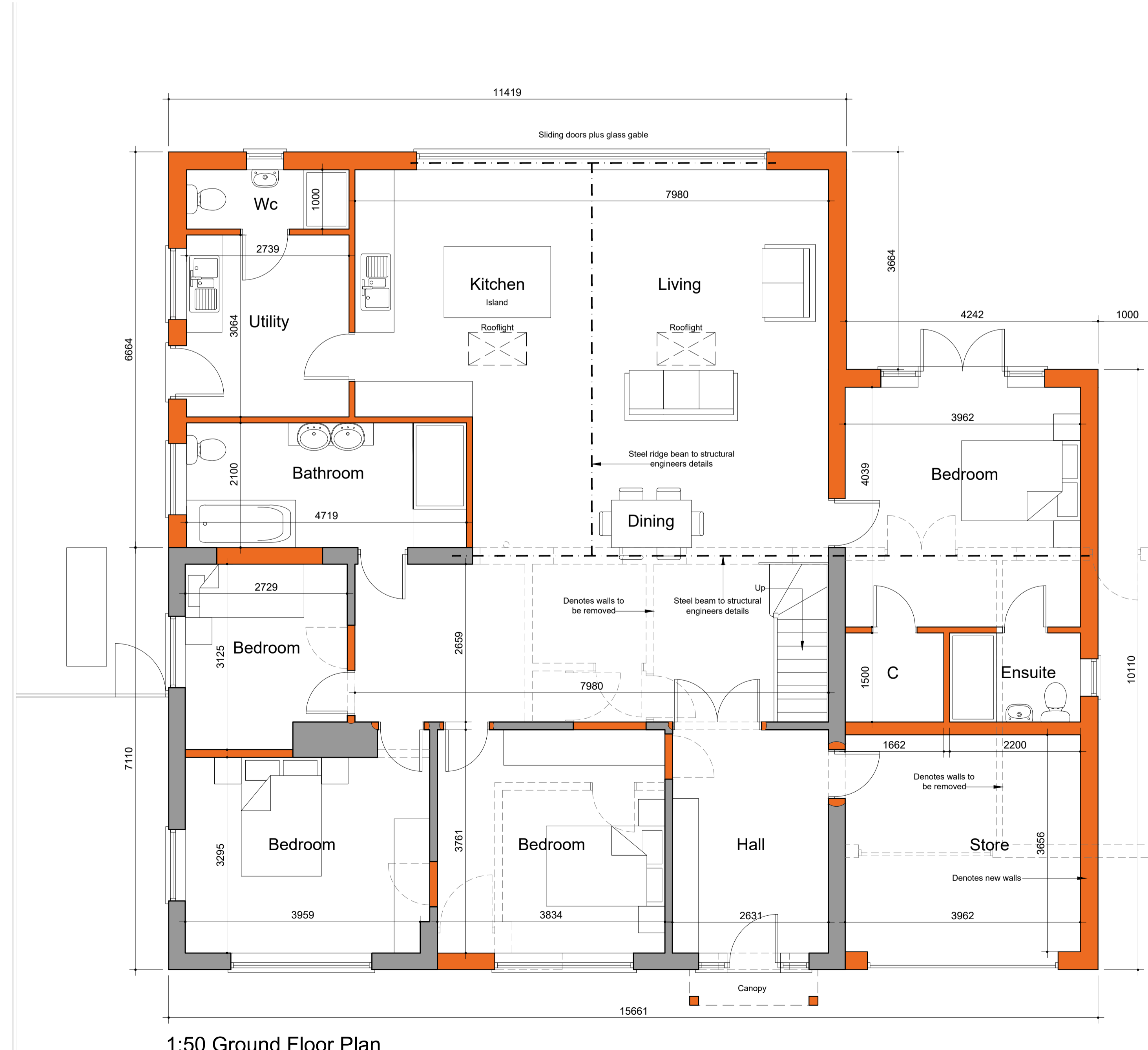
1:50 Ground Floor Plan