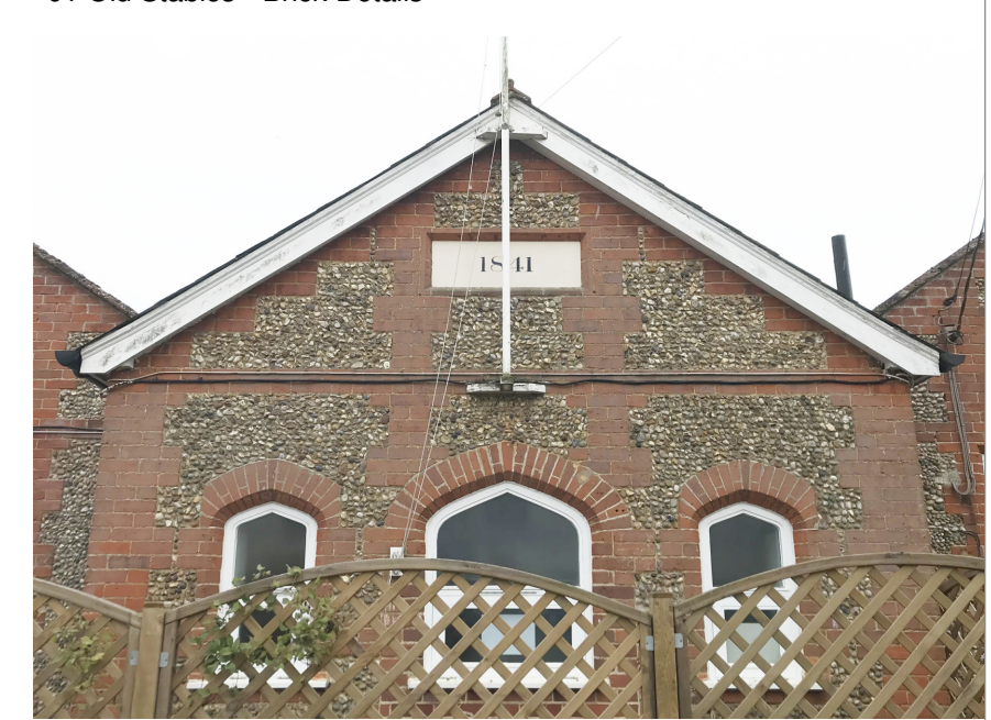
02 Tattingstone School - Brick Details