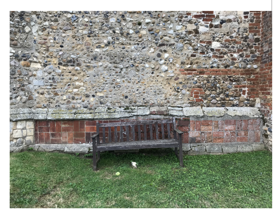
05 St Mary's Church - Various Material Details