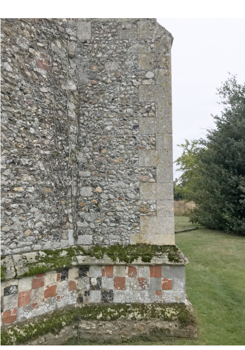
05 St Mary's Church