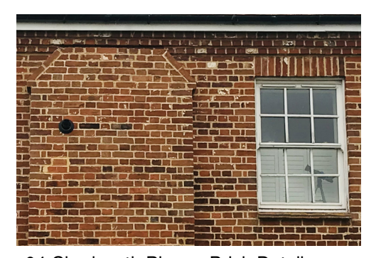
04 Chedworth Place - Brick Details