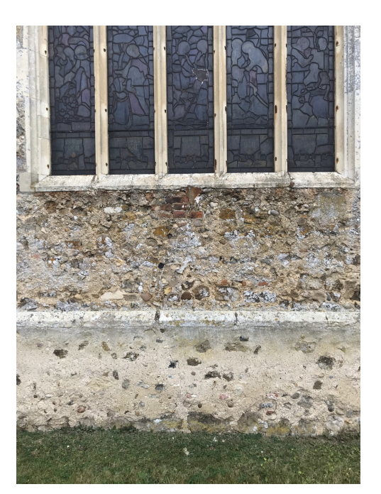
05 St Mary's Church

NO DIMENSIONS TO BE SCALED FROM THIS DRAWING