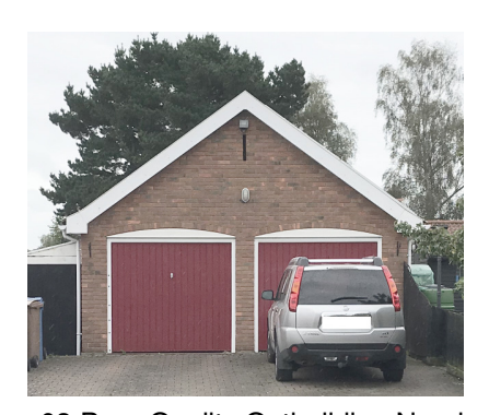
03 Poor Quality Outbuilding Nearby