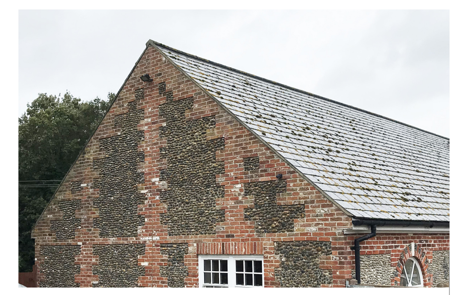
01 Old Stables - Brick Details