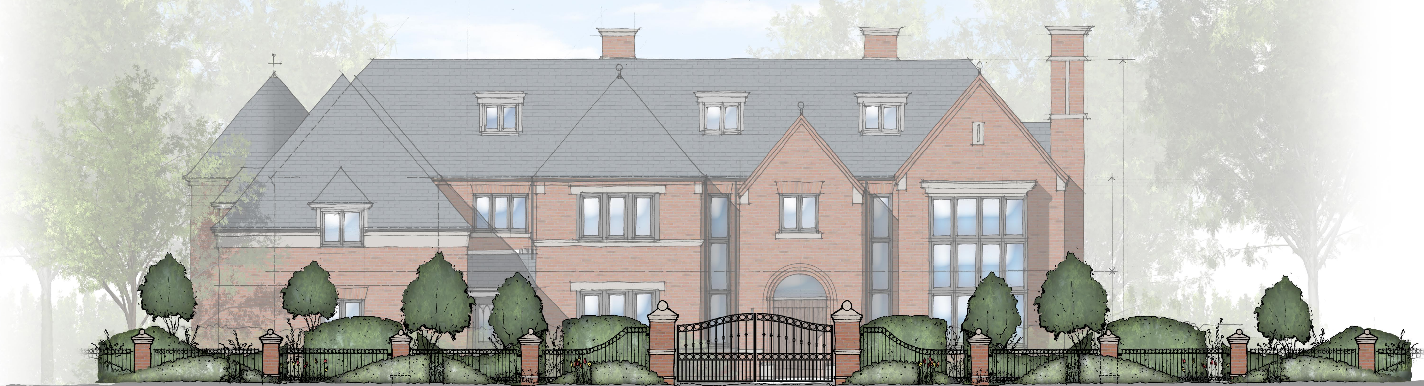
Proposed Front Entrance Gates and Boundary Fencing [Highlighting the relationship between the entrance gates and the proposed Dwelling] [scale 1:50]

The Builder is to check and verify all buildings and site dimensions, levels and sewer invert levels prior to commencement of work. Do not scale off this drawing, work to figured dimensions only. This drawing must be read and checked with all structural and relevant specialist drawings. The Builder is to comply in all respects with the current Building Regulations and latest Codes of Practice. Copyright of this drawing and of work executed from it remain the property of BHB Ritchie & Ritchie Ltd.