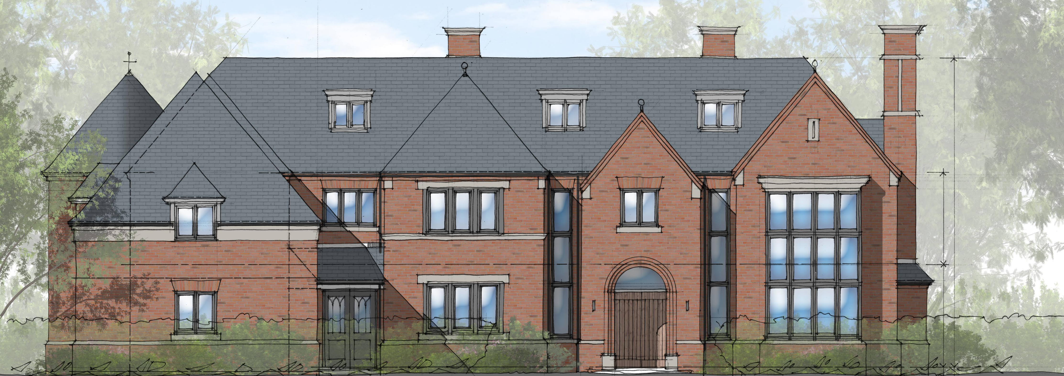
Proposed Front Elevations [scale 1:50]

The Builder is to check and verify all buildings and site dimensions, levels and sewer invert levels prior to commencement of work. Do not scale off this drawing, work to figured dimensions only. This drawing must be read and checked with all structural and relevant specialist drawings. The Builder is to comply in all respects with the current Building Regulations and latest Codes of Practice. Copyright of this drawing and of work executed from it remain the property of BHB Ritchie & Ritchie Ltd.