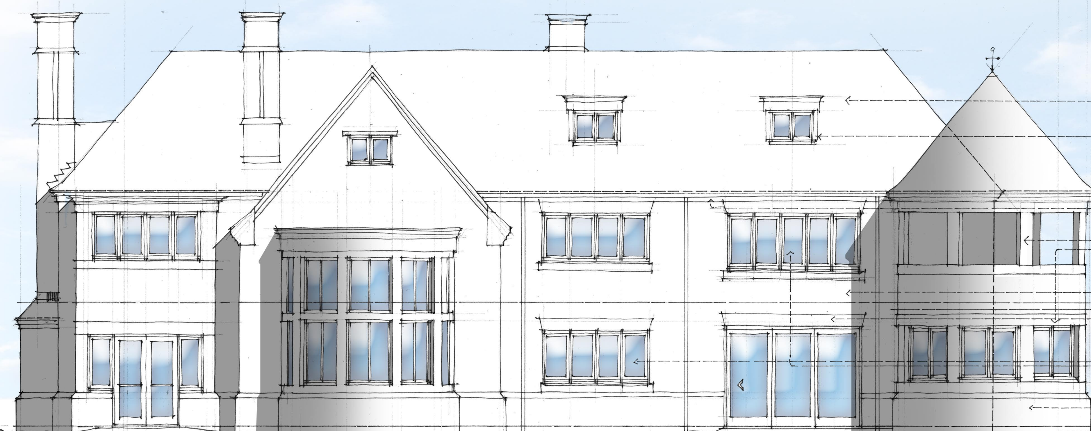
Proposed Rear Elevations [scale 1:50]

ROOF: Plain clay tiles, sample to approval, Hips to be BONNET type.