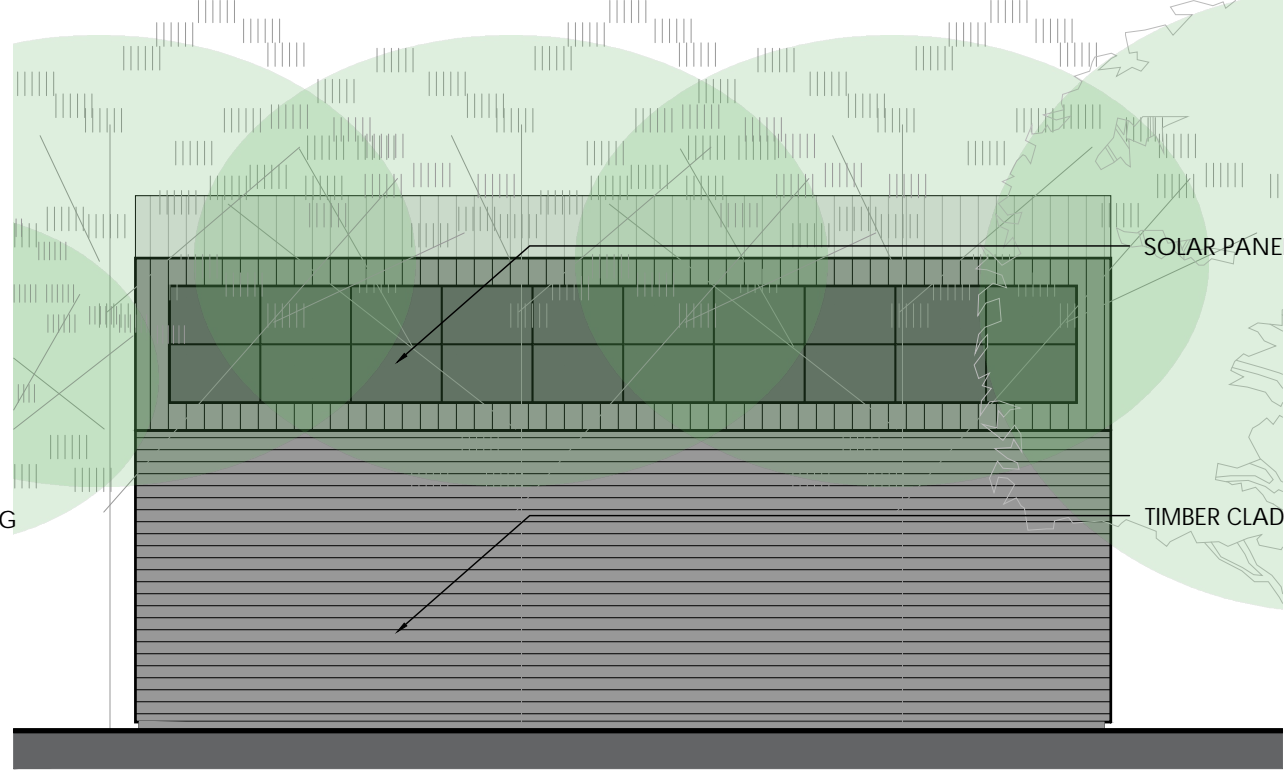
SOUTH (STREET) ELEVATION