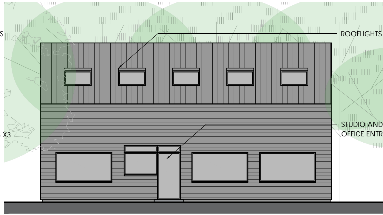
NORTH (VIEW) ELEVATION