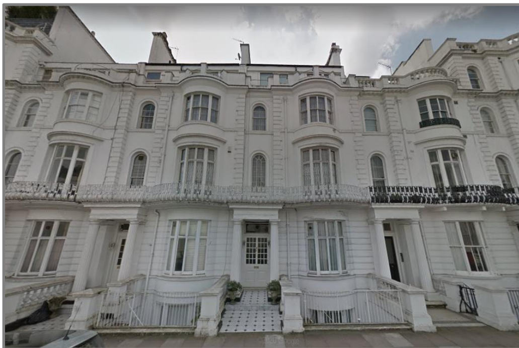
Fig. 3: Front elevation of 113 Gloucester Terrace