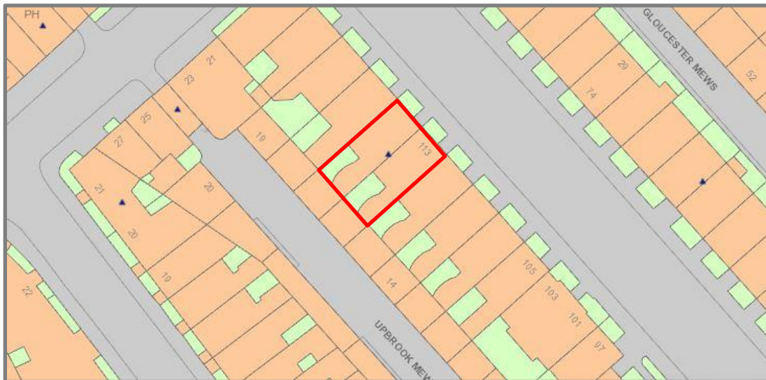
Fig. 2: Extract from Historic England Maps, showing the location of 113 Gloucester Terrace and various neighbouring listed buildings in close proximity