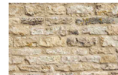
Cotswold stone walling