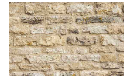
Cotswold stone walling