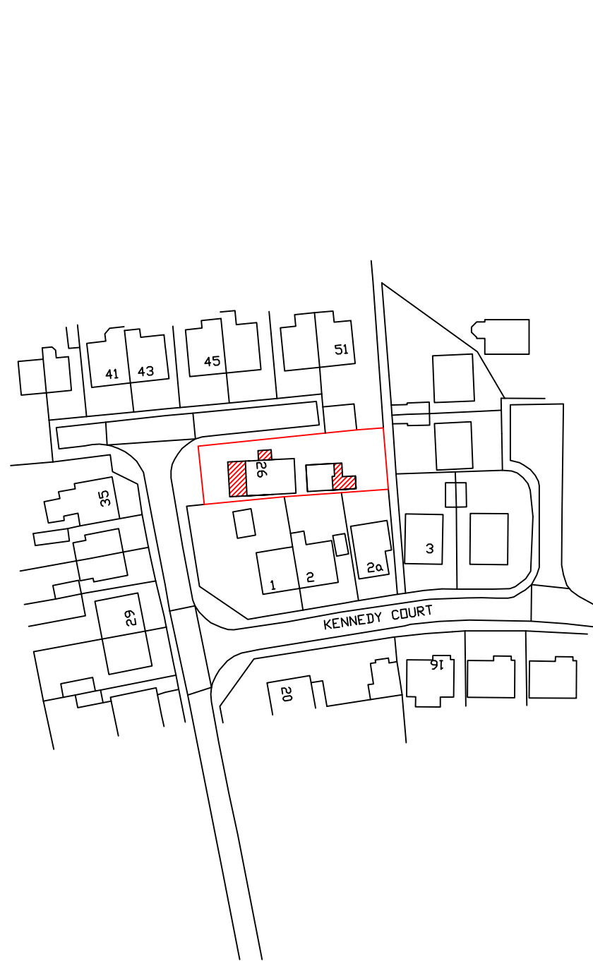
Site Plan (Scale 1:1250)