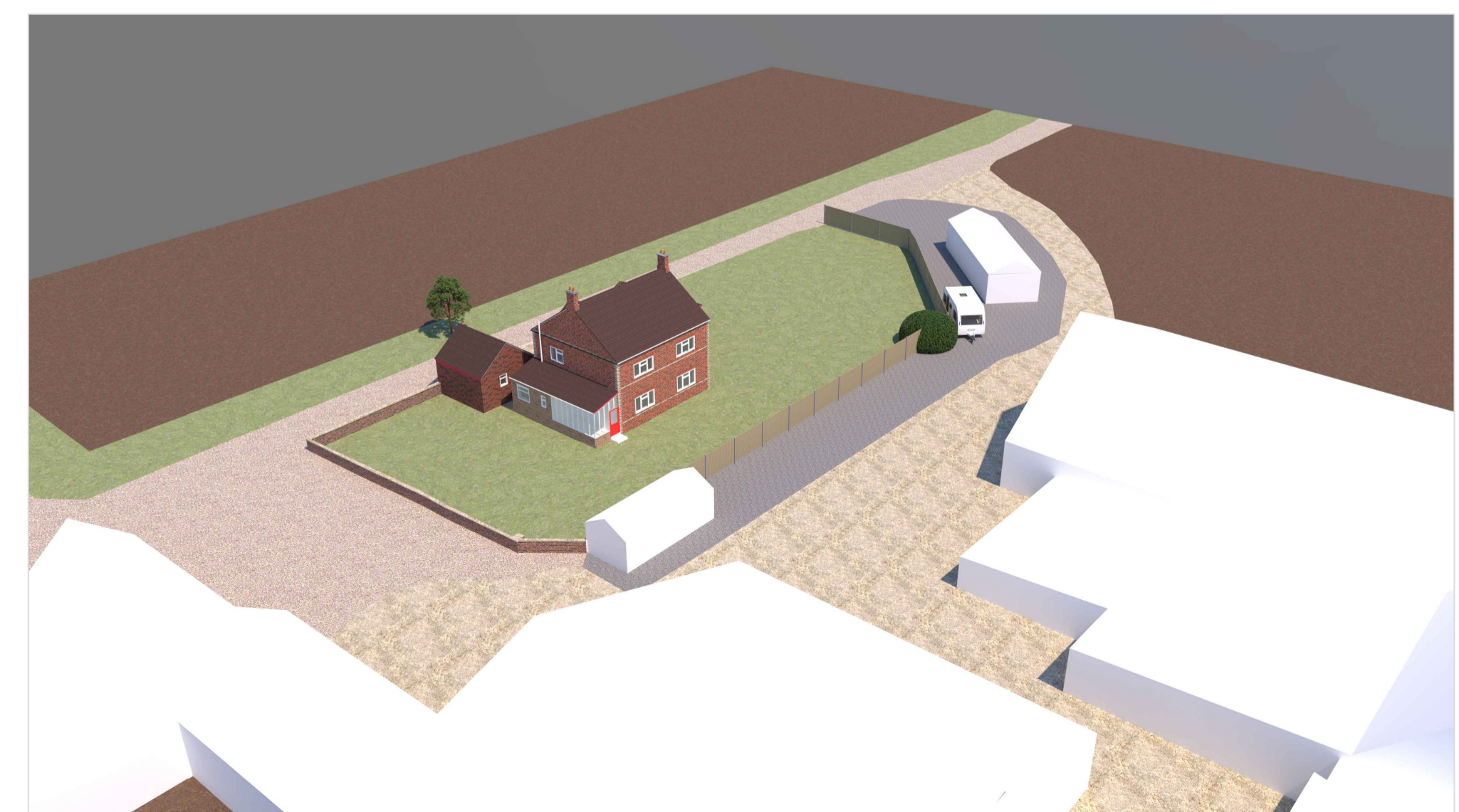
Existing Site Visuals (n.t.s)