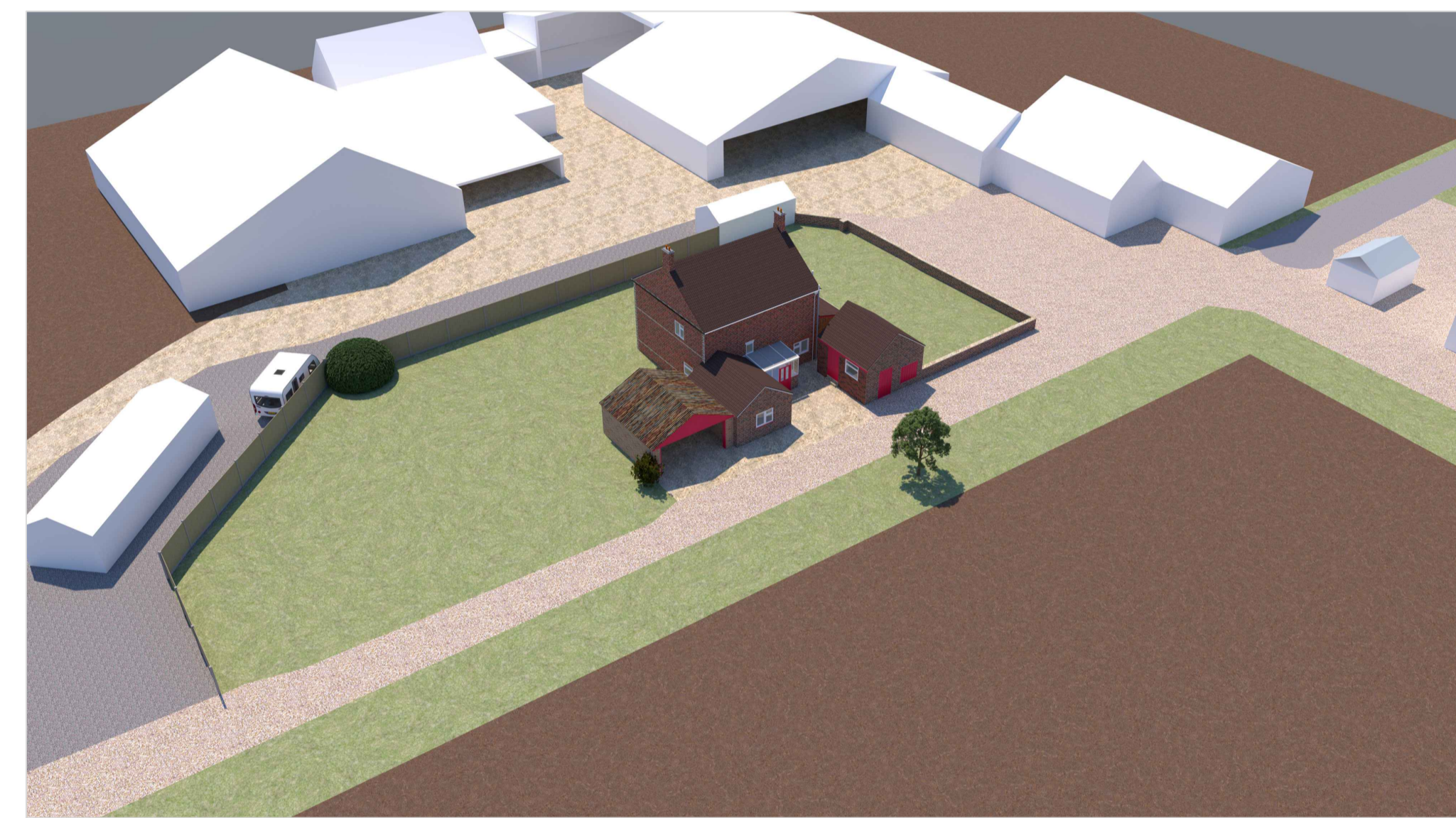
Existing Site Visuals (n.t.s)