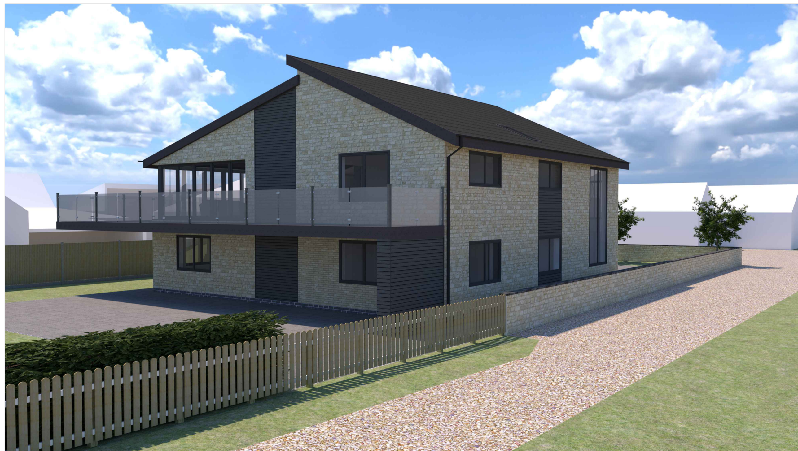
Proposed Rear Visuals (n.t.s)