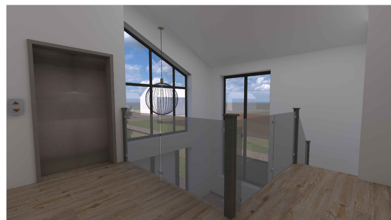
Proposed Internal Visuals (n.t.s)