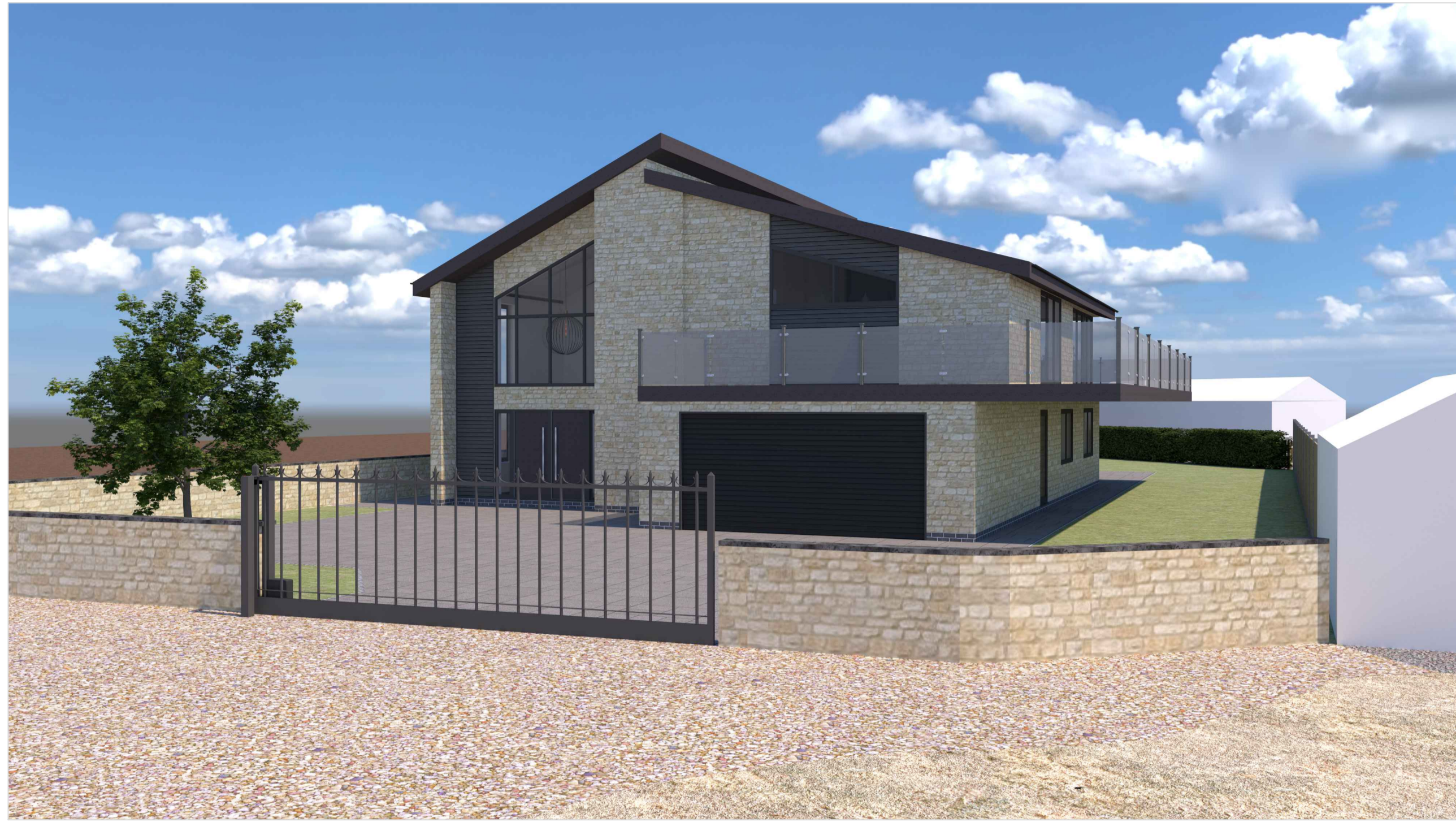
Proposed Front Visuals (n.t.s)