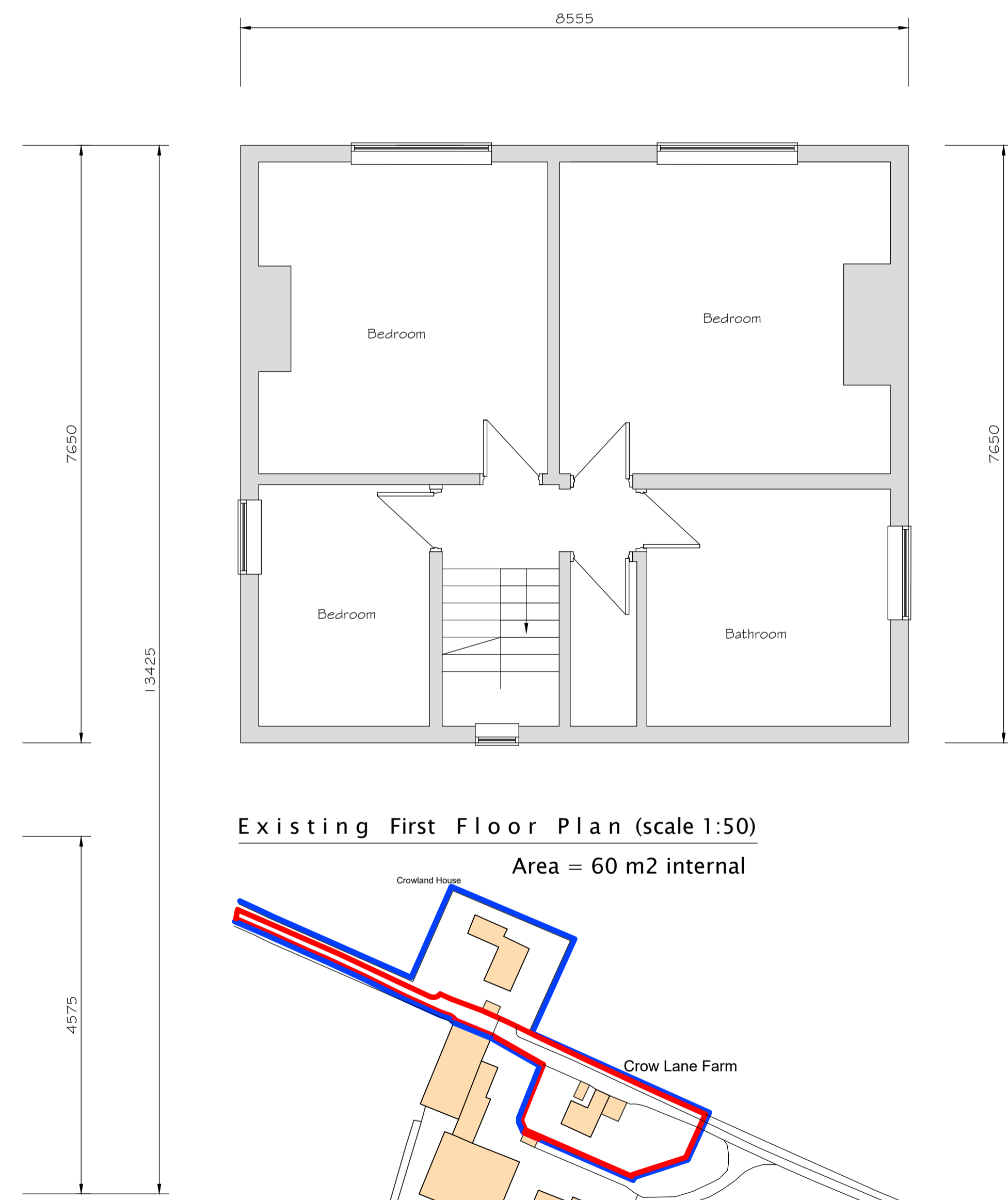
Existing First Floor Plan (scale 1:50) Area = 60 m2 internal