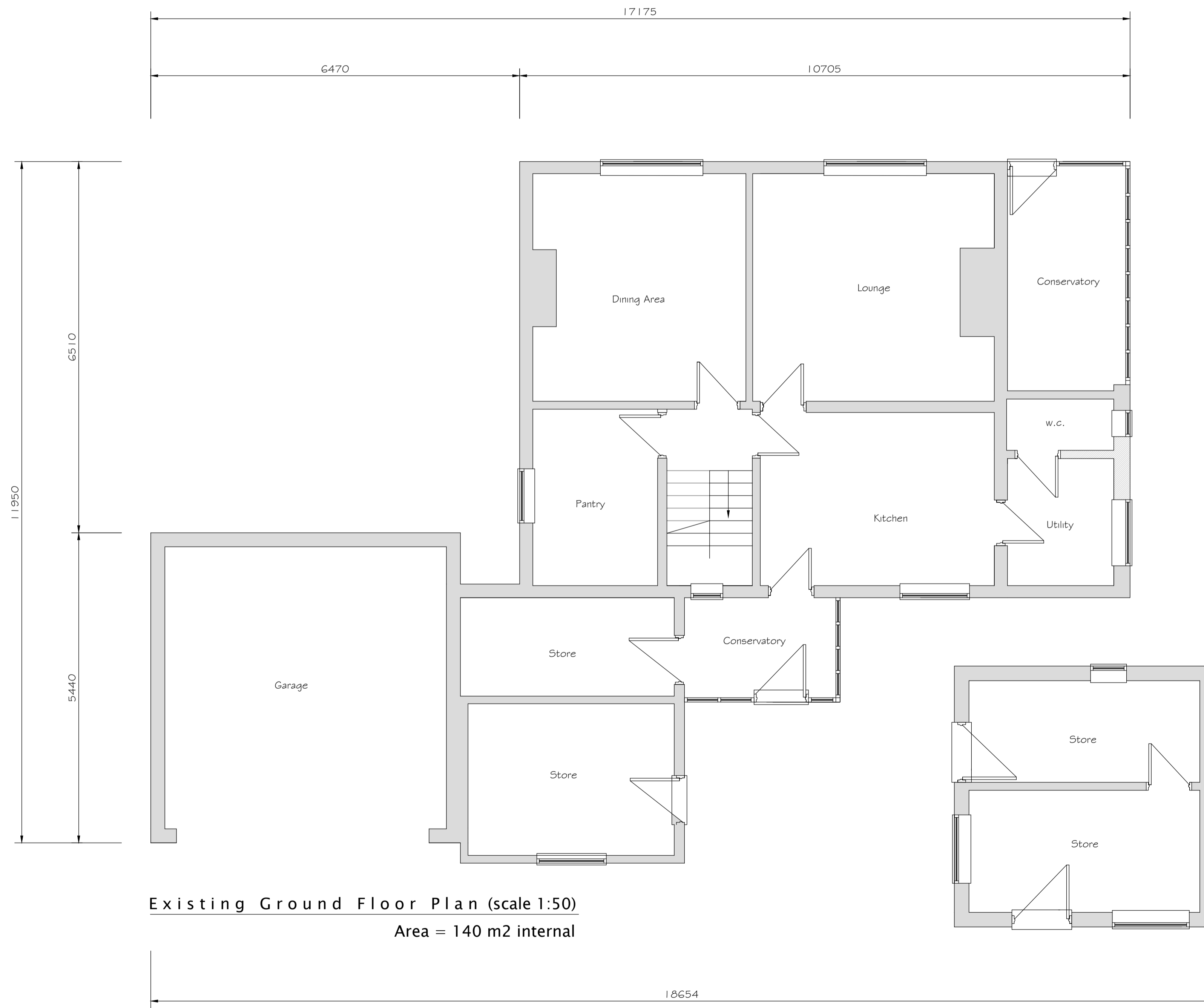
Existing Ground Floor Plan (scale 1:50) Area = 140 m2 internal