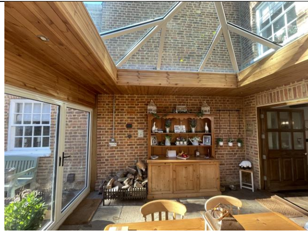
8. Rear extension.