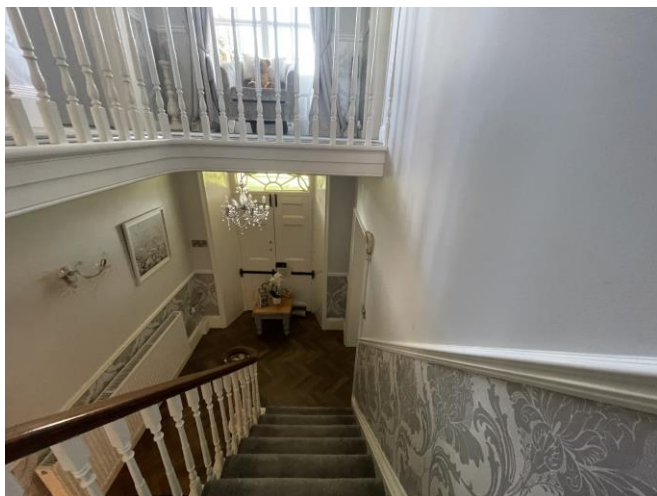
27. Floor tiles (Hallway)