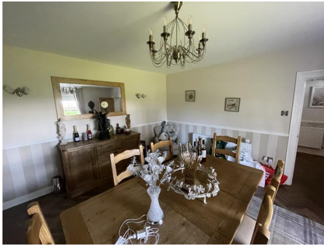
20. Repairs to traditional lath and plaster ceiling with modern materials (Living Room 2)