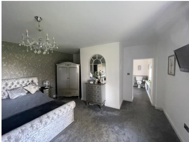
29. Knock through from two rooms to one (Ensuite 1)