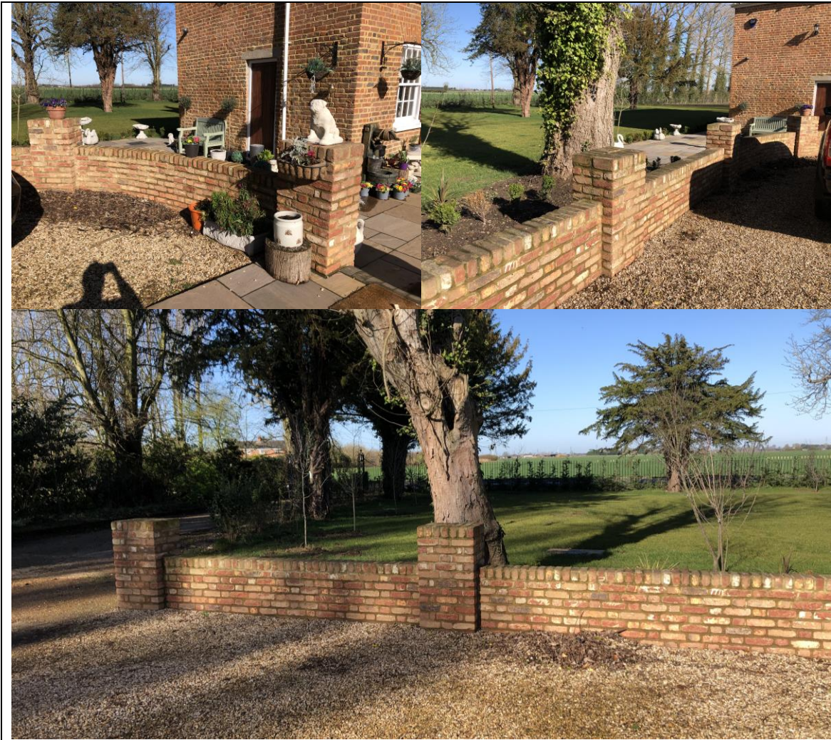
7. Side extension.