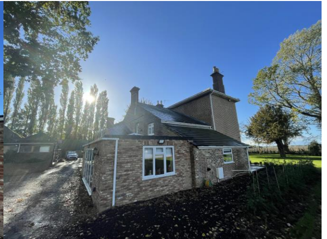
9. Change of small window to door on rear elevation.