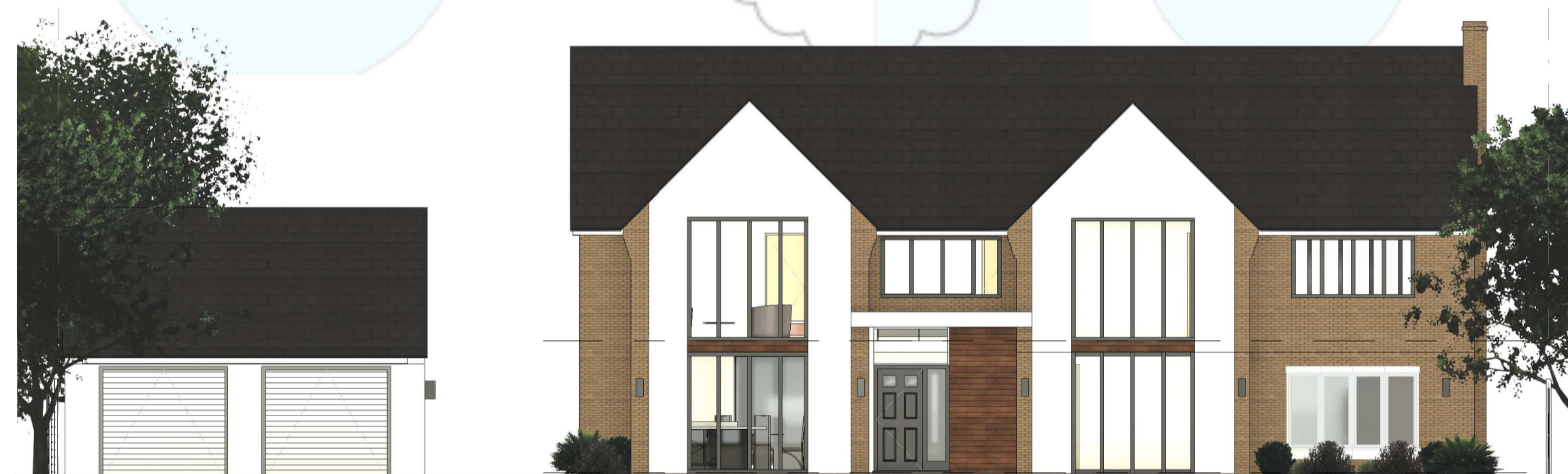
4 West 1:100