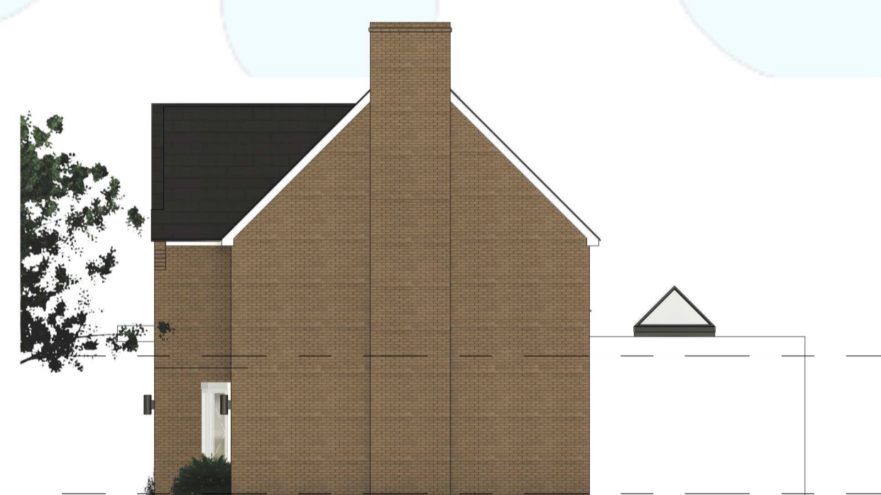
3 South 1:100