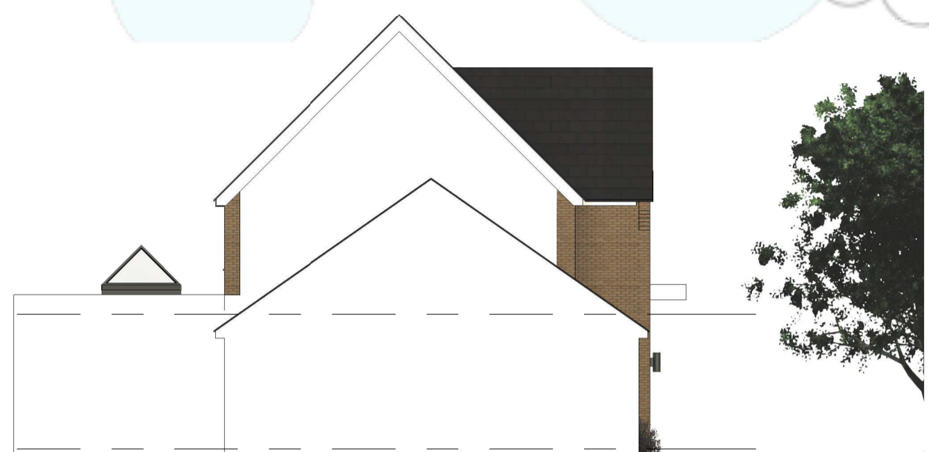
1 North 1:100