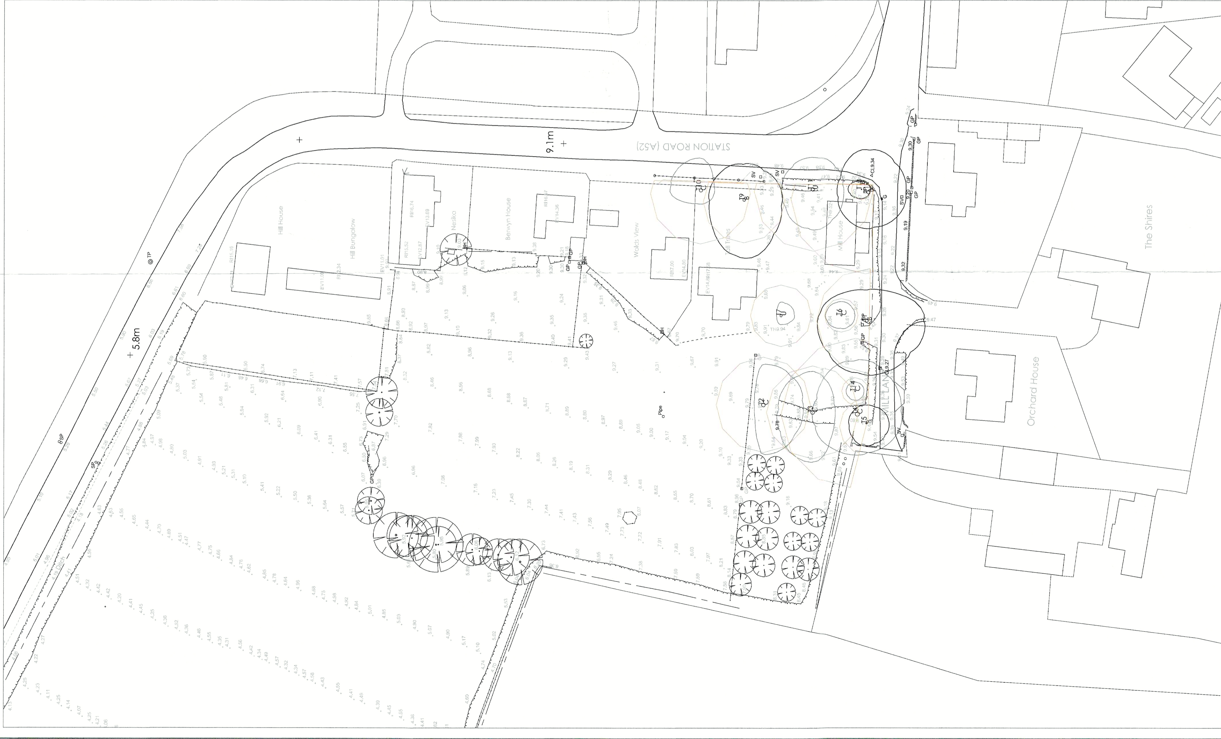
EXISTING BLOCK PLAN | 1:500