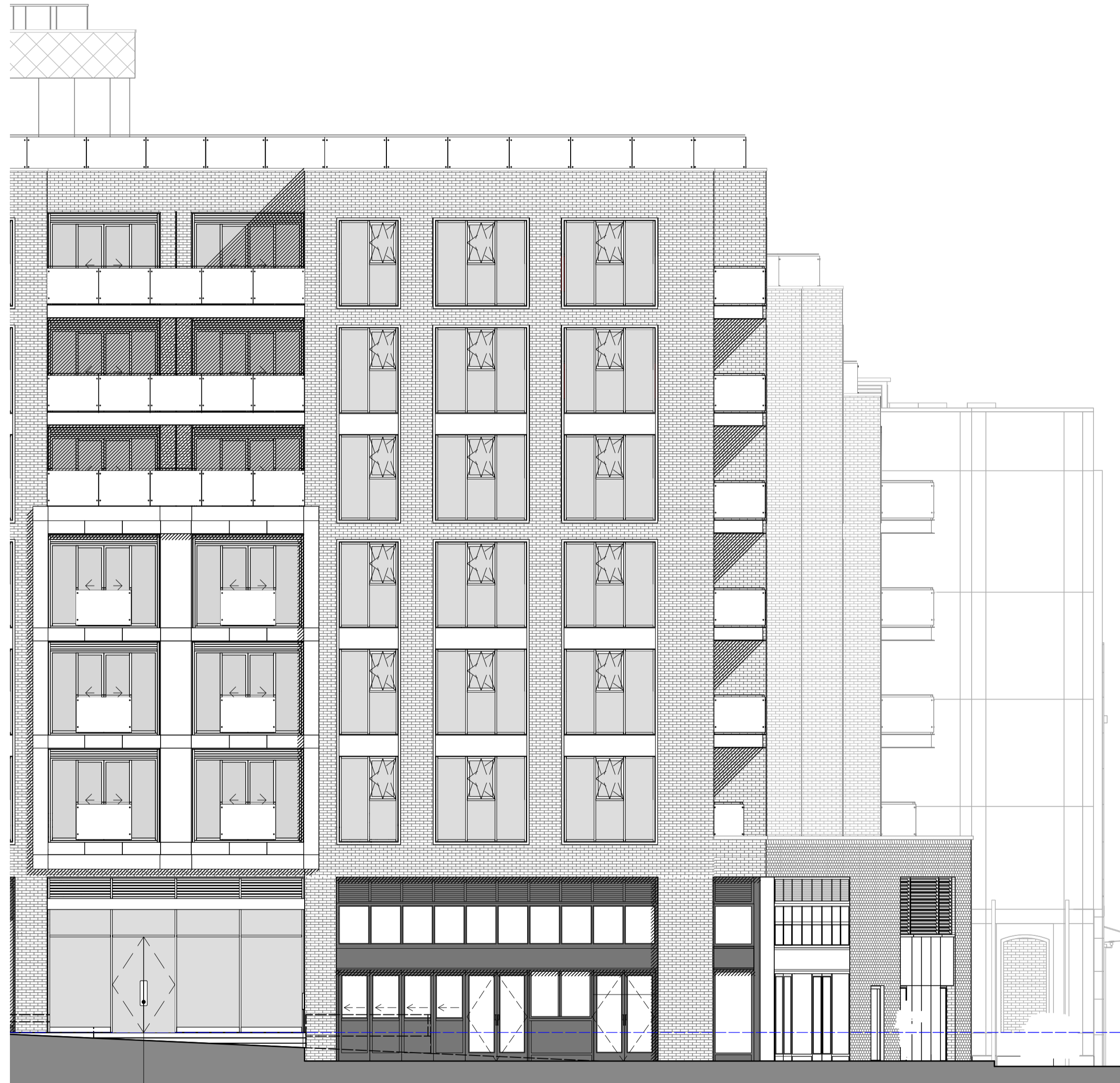
1 Unit 2.4 Cross Street Elevation (South) Scale: 1:100