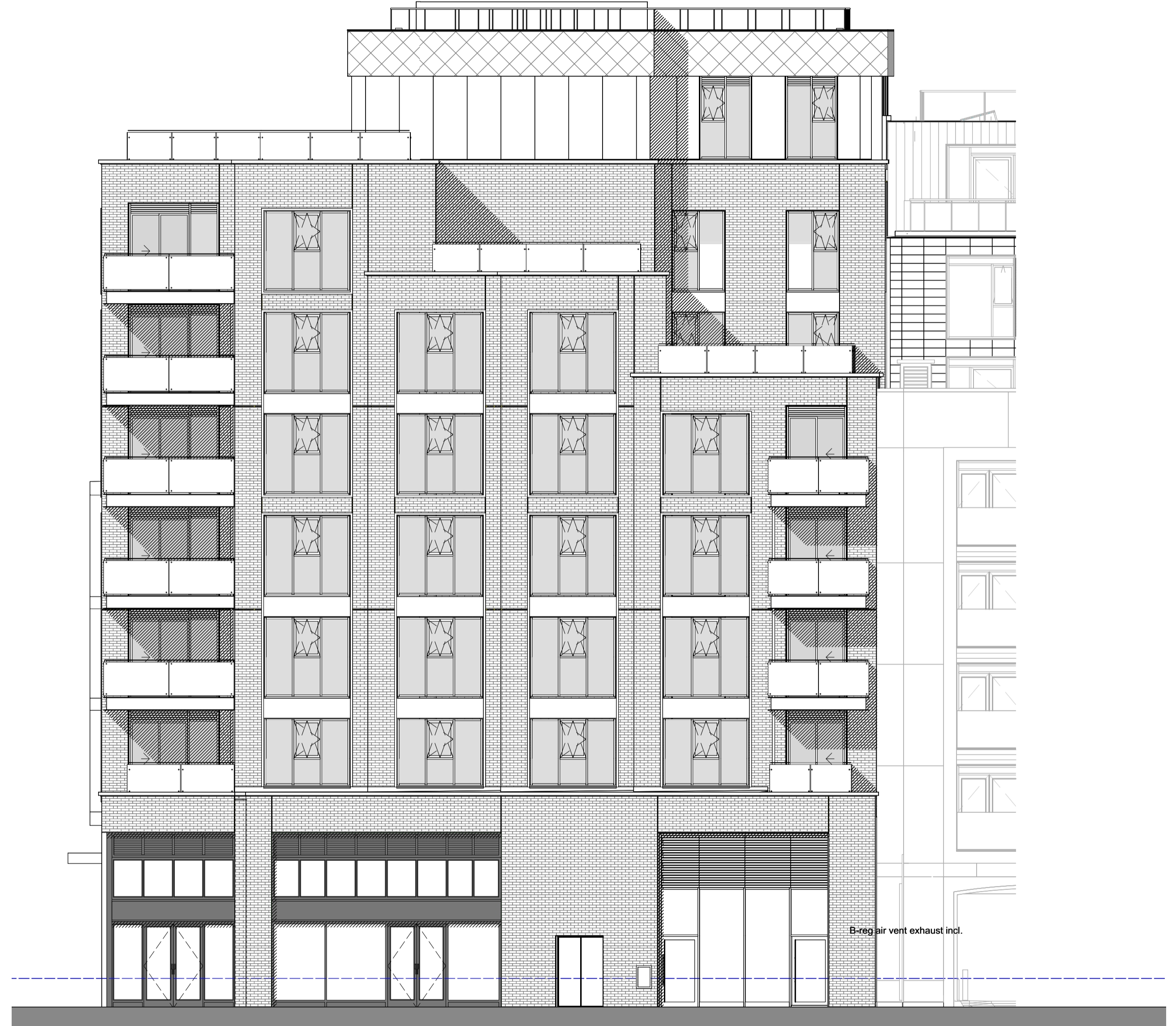
2 Unit 2.4 St Thomas Street Elevation (East) Scale: 1:100