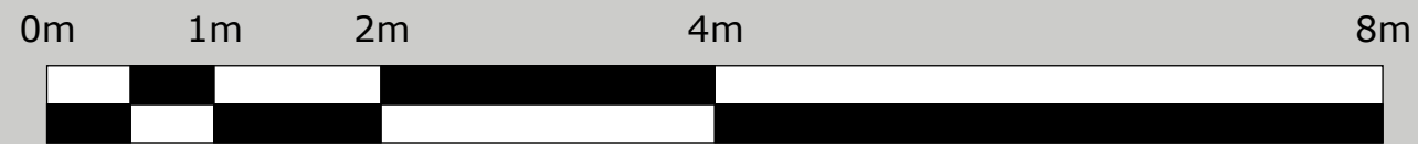
Scale Bar - 1:50